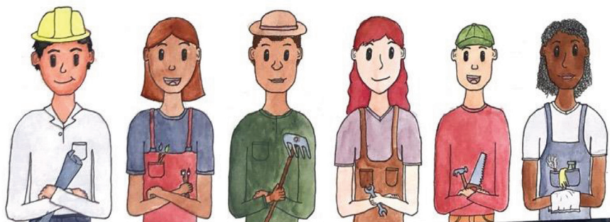
Figure 1 - Pluralism of the Community Psychosocial Center captured by artist and medical student Carlos Eduardo Filho