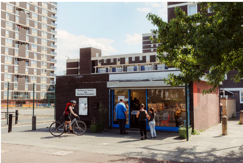
Three people queue and one volunteer waits for food to deliver outside one of the new Children With Voices community food hub locations on the De Beauvoir Estate in Hackney, 6th August, 2020. The Community Food Hub was evicted from the Wilton Estate Community Centre and now have 4 locations distributing the donated food.

The Government should track and ameliorate the impact of the pandemic on informalised workers who have been disproportionately impacted by it.