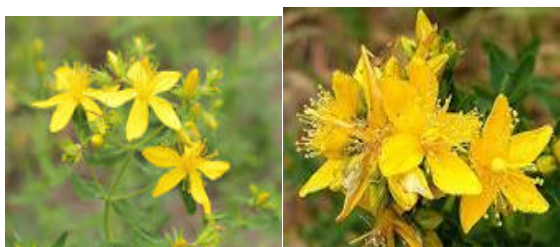
Figure 1: Hypericum perforatum