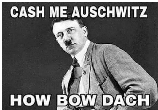
Example 10. Cash me Auschwitz.

In Example 10, Adolph Hitler is depicted as the central figure and the catchphrase is transformed to be congruent with this image: outside is changed to Auschwitz and the final word (i.e., that , represented most commonly in our dataset as dah ) is substituted here by the German word, dach . Beyond the modified catchphrase, there is no visual representation of Danielle here; however, the figure of Hitler is obviously associated with aggression and violent threats. In order for these types of voicing examples to be effective, there must be some correspondence between the individual depicted and a variation of the catchphrase that in some way references this particular individual's manner of speaking. In Example 10, the use of German words connects the text to Hitler.