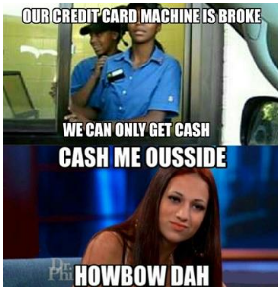
Example 2. Credit Card Machine is Broke.

Example 2 is identical in format, and also relies on the literal meaning of cash as money. This time, the service interaction setting represented in the top panel is that of a fast-food restaurant drive-through, with the employee explaining that the credit card machine is not working, so we can only get cash . The image of Danielle with her catchphrase again appears in the lower panel.