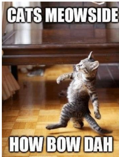
Example 6. Cats Meowside.

reduced to cat or cats . Very often, this is then followed by an orthographic representation of the (phonologically reduced) elements “me” + “ou[w]” + “[tside],” which creates another paronymic form: the onomatopoeic meow appearing in Examples 6-8. This morphophonemic wordplay is paralleled visually through the accompanying images of various cats.