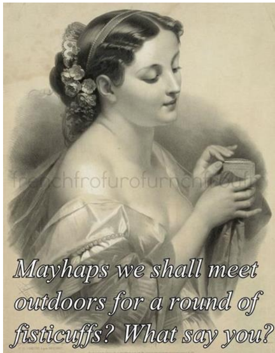
Example 17. Mayhaps we shall meet outdoors.

The black and white image in Example 17 also does not incorporate any visual references to Danielle. In it, the text that appears along with the image of the Victorian woman depicted shares some similarities with the text in Example 14. However, in Example 17, register humor is exploited further, as the textual component is additionally archaicized not only with fisticuffs but also with lexical forms such as mayhaps and shall , associated with more historical speech. In this example, both the text and the image work together to communicate in the same historical register – and it is only through the presupposed background familiarity with Danielle's colloquial and non-standard catchphrase that the original utterance comes across as stylistically incongruous. In other words, the original source is only indirectly alluded to through the verbose, “historicizing” paraphrase of Danielle's utterance, thereby requiring the audience to be aware of the original wording of the meme's catchphrase in order to understand and appreciate the incongruity.