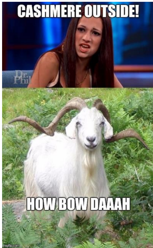
Example 5. Cashmere.

similar to the one on the bottom left panel in Example 4. Whereas Examples 1-3 seemed to highlight the contrast between a polite, or at least ordinary, service encounter utterance with Danielle's more aggressive or challenging stance, the relative placement of the two text-image components in Example 5 suggest instead a relation of comparison – i.e., Danielle's speech is analogous to the sounds produced by an animal.