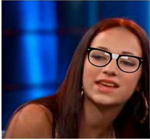
Example 14. Confront me Outdoors.

Confront me outdoors to resolve our preexisting issues with a battle of fisticuffs. Does that offer suit your needs?