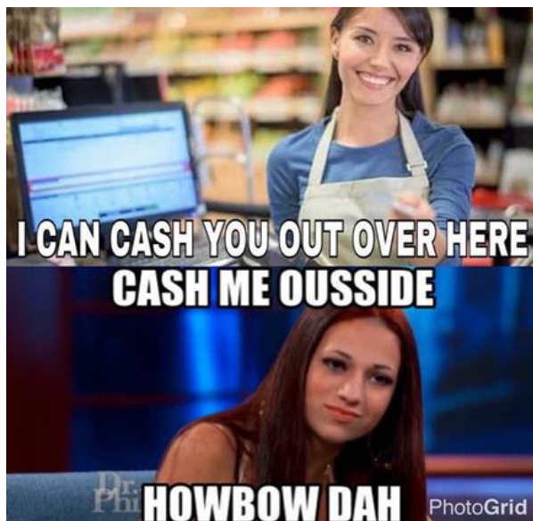
Example 1. Cash You Out.

In Example 1, the cash from catchphrase, is interpreted literally in the top image, where the visual of a smiling cashier is reinforced with the textual offer, I can cash you out over here . This image macro uses a dual image format that invites the initial processing of the top half, which provides the linguistic set-up, followed by the bottom half, which includes the complete catchphrase and serves as the “punchline.” Here, the bottom half of the image macro consists of a visual of Danielle on the set of the Dr. Phil program, with the complete catchphrase overlaid on the image. The incongruity presented here lies in the contrast of the polite service encounter with a smiling cashier juxtaposed with the more aggressive stance presented in the original “cash me outside” utterance.