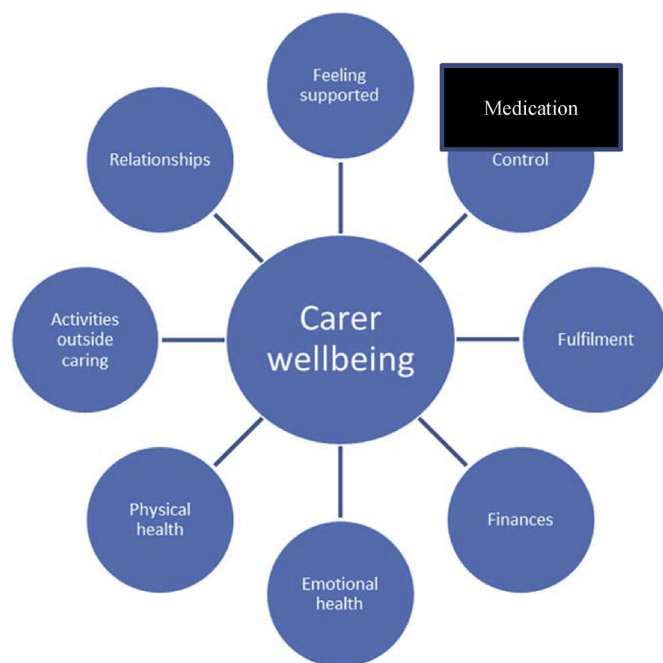
Fig. 1. Focus group exercise to identify links between patient services and carer wellbeing. Circles indicate pre-defined outcomes (Brouwer et al., 2006; Deeken et al., 2003; Al-Janabi et al., 2008) and the rectangle is example of patient intervention or aspect of service delivery. Note: Intervention prompts (cards) were: medication, psychological intervention, rehabilitation, complementary/alternative therapy, and social care. Service delivery cards were: inpatient care, transfers between services, involvement of family, funding/organisational changes, and location of care. Participants were also provided with blank cards.

through a focus group and/or interview; and (iii) thematic saturation had been reached as judged through field notes.