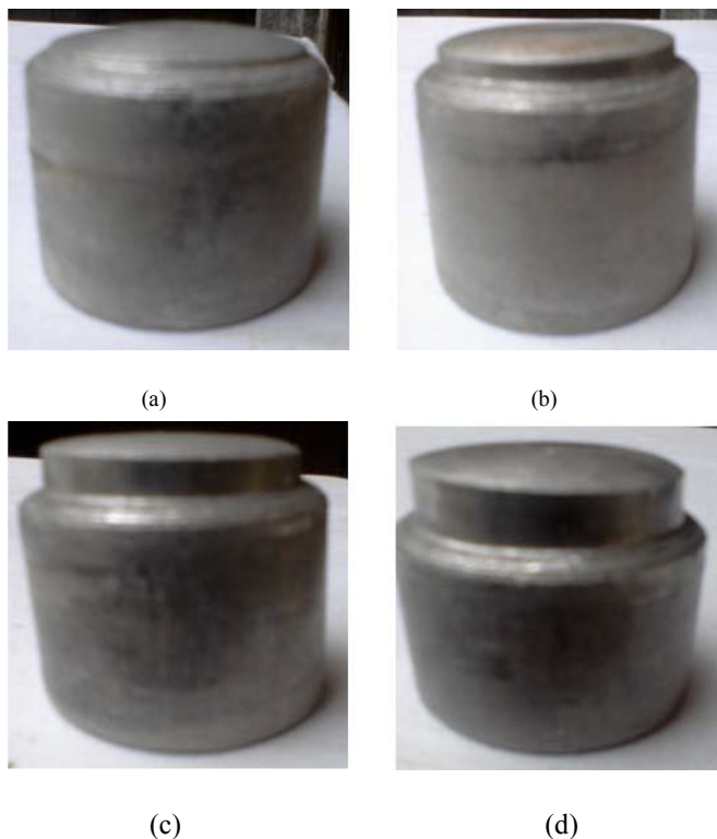
Fig. 2 Extrudates formed with different punch diameters (a) 12 mm punch diameter; (b) 14 mm punch diameter; (c) 16 mm punch diameter; (d) 18 mm punch diameter

Fig. 3 shows the graphical representation of the load (kN) applied against the travel of ram or the ram displacement (mm) for the punch diameters of 12 mm, 14 mm, 16 mm and 18 mm respectively.