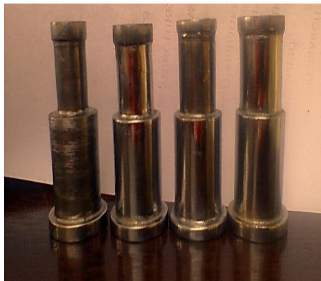
Fig. 1 Punches with different diameters

Fig. 1 shows the punches of different diameters (12 mm, 14 mm, 16 mm, and 18 mm) with a punch land of 3.0 mm.