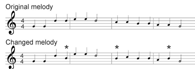
Figure 1. An excerpt of the stimuli used in the experiment. The image score above represents the original unchanged melody while the score below shows the changed melody. Changed notes are marked with asterisks.

In the EEG-experiments a modified version of the “Twinkle twinkle little star” -melody was played to the infants 9 times. In the modified melody, 12.5% of the notes in the original melody were replaced at random with B (H in German notation) -notes (called changed sounds from now on; the unchanged notes are referred to as unchanged sounds ; see Figure 1). The changes are key-preserving as B belongs to G-major scale and thus are not more salient than unchanged notes on basis of the key of the melody. However, a listener who is familiar with the original melody can recognize the changed sounds easily (see, e.g., [31], for a similar paradigm). The melody was played with a 600 ms stimulus onset asynchrony (SOA) between the sounds. With the exception of the changed sounds, all characteristics of the experimental melody (e.g. tempo, key) were kept identical with the melody the infants were exposed to prenatally. Speech phrases and other musical sounds, similar to those on the learning tape, were presented between the melodies.