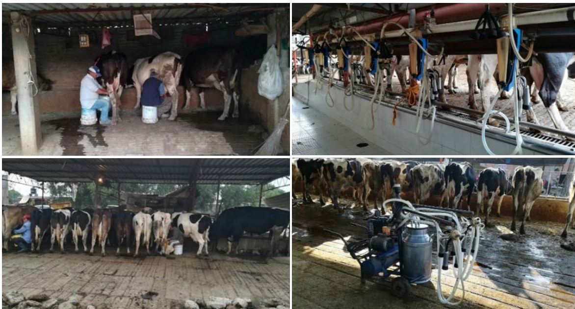
Figure 2. Manual and mechanical milking system.

Nutritional quality of raw milk. It is fundamental for milk to conserve its nutritional and hygienic quality, even if this is related to a higher cost to the consumers. The estimated values for fat content varied between 3.6 and 4.42, due to the amount of fiber included in the cow's diet; with higher fiber content values, there is higher fat percentage in the milk. In these small herds, the fodder/concentrate ratio is high, with the proportion most likely increasing due to elevated concentrate costs and the fact that many produce their own fodder. The average lactose content was 4.21 and protein was 3.01, while the highest values were 4.63 and 3.87, respectively. These values are very similar to those reported in other studies, and they comply with milk quality norms and are not modified by the presence of mastitis.