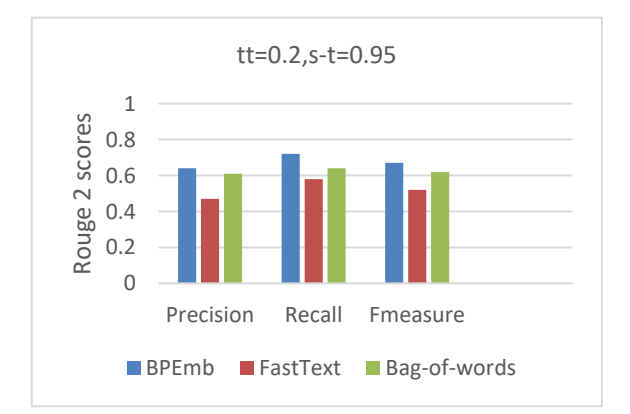
Figure 4. Rouge2 scores of Centroid summarizer based embedding models (BPEmb, and FastText) and bagof-words model with parameter values [tt=0.2, sim-t=0.95]

Figure 3. Rouge2 scores of Centroid summarizer based embedding models (BPEmb, and FastText) and bag-of-words model with parameter values [tt=0.3, sim-t=0.96]