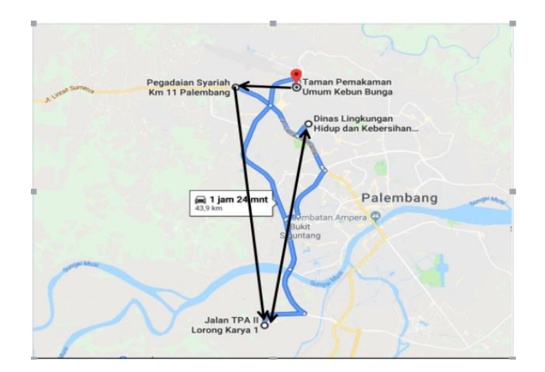
Figure 1. WA 1 in Sukarami Sub-District

Sukarami Sub-District has 3 TWDs with 1 vehicle used to transport waste from 3 TWDs. Table 3 is the solution to the search for waste transportation routes in working area 1 by using LINGO 13.0. Variable with value of 1 means that the route is passed, while variables with value of 0 are not passed. Minimum distance obtained was of 21.99 km with a deadline time of 160.98 minutes or 2 hours 41 minutes as Table 3 explained. Figure 1 depicts the optimal route for transportation of waste, starting from Kebun Bunga TWD - KM 11 TWD - Karya Jaya FWD – DKK TWD - Karya Jaya FWD. If compared with research from Puspita et al [1], there are different results due to additional FWD recently and updated the distance and volume of waste. Table 4 displays the results for 6 WA in Sukarami by LINGO 13.0.