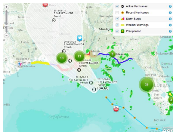
Figure 1 Live hurricane map from esri.com

standard ArcGIS API (Application Programming Interface) for third parties to tap into the data and develop custom applications ( http://www.arcgis.com/home/item.html?id=c74acddfc_b1844eb90f8f9d40be2c823 ). The map itself is updated through social media services, such as, Twitter, YouTube and Flickr feeds by using location info and tags in those services. The result is a map augmented with end-user information and possible new third party services.