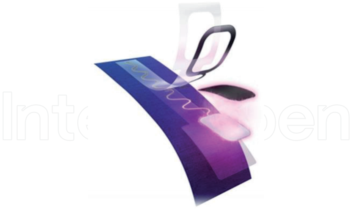
Figure 7. Smart film fabric.

construction, military, forestry, mining, and infrastructure industries, among others. This technology also delivers advanced wearable health care through the sense and transmission of biometric signals. Primary uses include monitoring of pregnancy, telemetry and respiratory disorders as well as heat and electro-stimulation therapies.