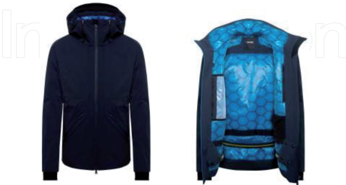
Figure 5. Graphene-based jacket.

The smart denim jacket designed by Levi's turns a portion of the fabric on the sleeve into a touch-sensitive remote control for phones to be helpful in everyday life. This is a second version of their Jacquard smart jacket first introduced in 2017.