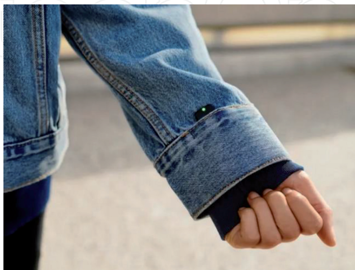
Figure 6. Smart denim jacket.

Intexar is engineered and tested to perform as designed each and every time, with durability to outlast any alternative and offer unmatched comfort with its seamless stretchability. Intexar also offers a powered heating solution in a thin and safe application. The battery-operated technology enables clothing to generate heat, creating actively controlled on-body warming. This technology is particularly well-suited for outdoor activity and industry professionals within the utility,