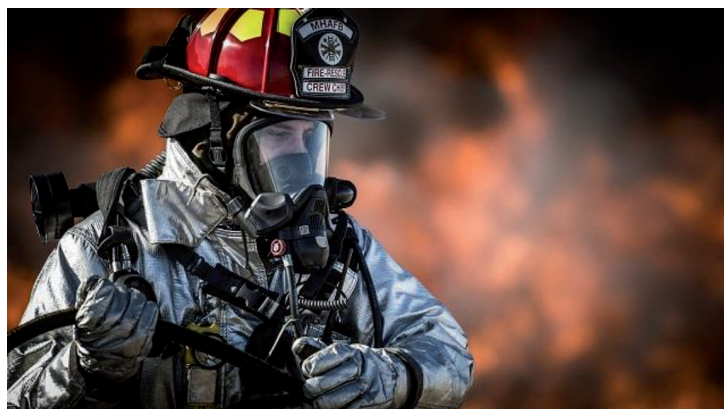
Figure 4. Smart clothing, adjusting the heating control autonomously.

A renowned company Directa Plus, a producer and supplier of graphene-based products, teamed up with Colmar, the high-end sportswear company, has launched a new collection of SKI jackets containing graphene-based products.