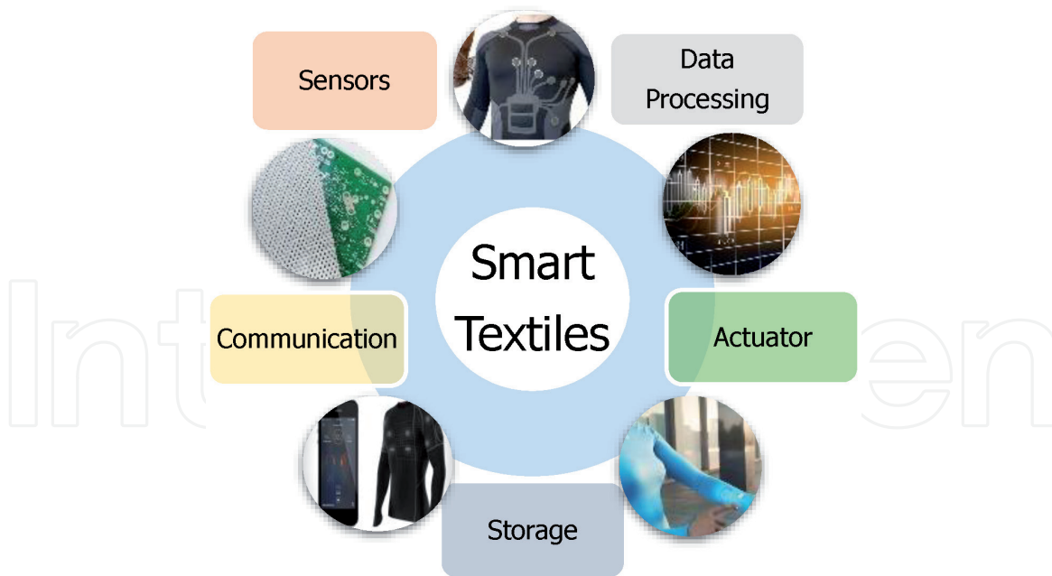
Figure 1. Functions of smart textiles.

as sensors, data processing, actuators, storage, and communication ( Figure 1 ). But it must be compatible with the function of clothing such as comfort, durability, resistant to regular textile maintenance processes, and so on [1, 2].