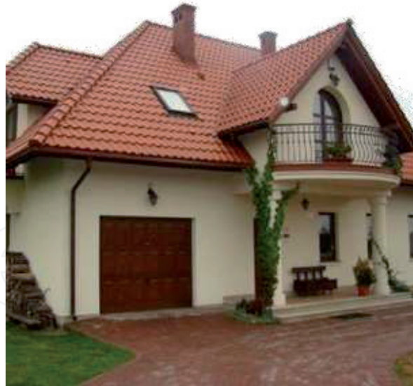
Figure 1. The complex shape rooftop [3].

the area of the roof and the number of resources necessary to design the roof of the building. The “Home Foundation Field” is the land region that the building covers, which can be measured for more complicated forms using the Area Calculator. The measured area is an estimate only. In situations where a rooftop has a complex shape, such as Figure 1 , calculating the measurements and areas of each part of the rooftop of a building to determine the total area would result in a more precise calculation of the surface.