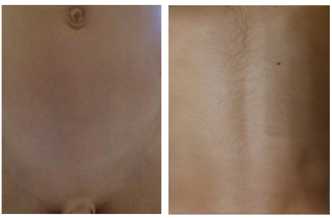
Fig. 3. Absence of hernia and appearance of paravertebral muscles after treatment.

The diagnosis established today is inguinal hernia acquired on the right, which is also shown in the picture below.