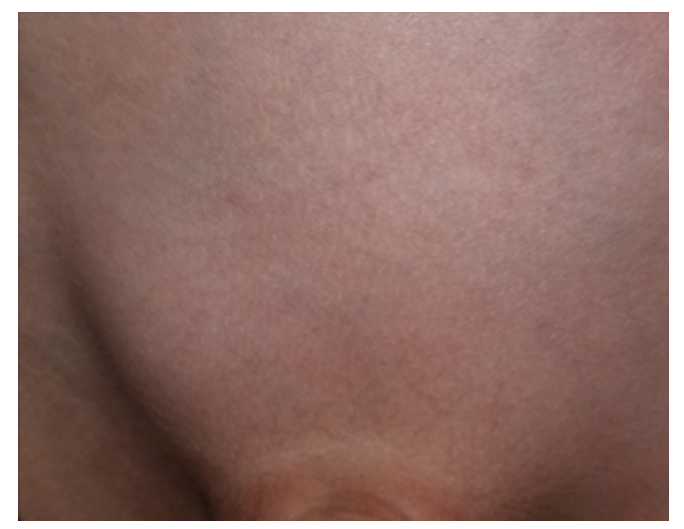
Fig. 1. Inguinal hernia on the right.

without any complications, 3.6 kg weight. 5-6 months after birth, in the region of the right inguinal canal, during the weeping there was a swelling, the size of a cherry, which in the palpation gave a feeling of crepitation. After referring to the pediatric surgeon it was established the diagnosis of incipient congenital inguinal hernia. Hernia has developed from the peritoneovaginal process, which obliterated after birth. In the case of this child, it persisted and was recommended a surgical intervention in order to terminate the process. Parents refused to have the child operated on motivating that the swelling was diminishing in dimensions, compared to its initial ones. They struggled to compress this formation with a diaper, which was fixed just above the hernia. Half a year later hernia disappeared. The pediatric surgeon who repeatedly consulted the child stated that the peritonoevaginal process had stopped and the child had no