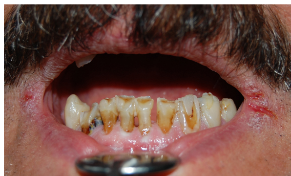
Figure 4 Cheilitis and cracked lips, and teeth cervical caries in a radiotherapeutic patient.

Therapy options in xerostomia depend on the presence of residual secretion or the absence of it. When residual