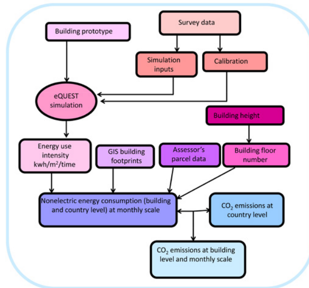
Fig. 2. Downscaling approach in the Hestia project.

As one of the main tasks of the project is to obtain an appropriate allocation of GHG emissions at the fine building and hourly scales, the completion of the GHG emission inventory will be followed by downscaling emissions across the Sassari town area. For this purpose, the Hestia Project method will be used [8]. This approach combines a series of data sets and simulation tools for estimation down to the individual building scale, road segments and electricity production facilities at the hourly time scale and for allocating these non-point sources CO 2 emissions.