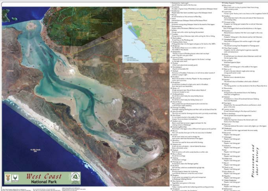
(Case example and map provided with kind permission by Pierre Nel, WCNP 2013)

In the Langebaan MPA within the West Coast National Park, the MPA has actively included persons from a local fishing family in documenting the cultural histories of the fishing communities in the Park.