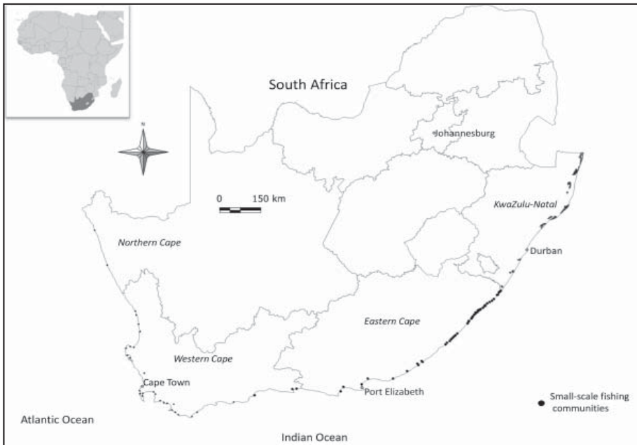
Figure 1. Small-scale fishing communities along the South African coastline