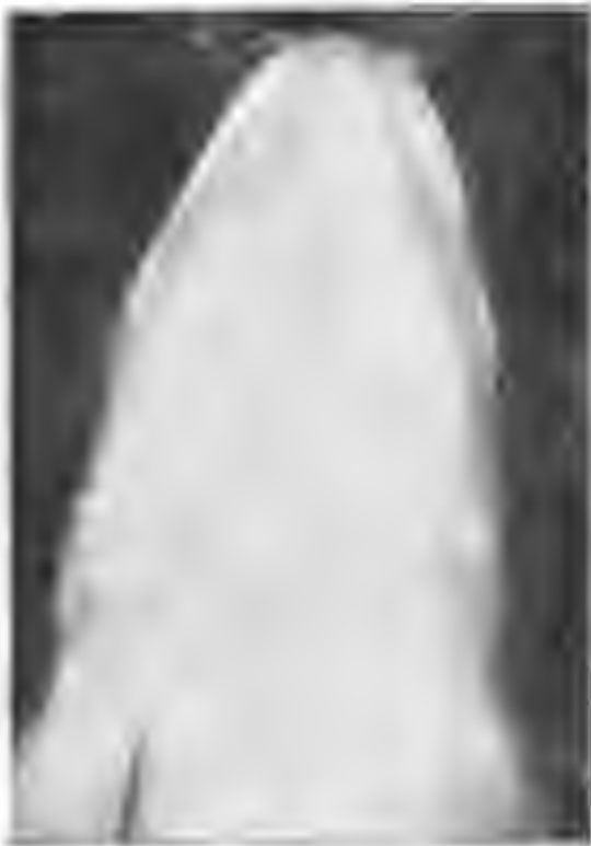
Fig. 2. Ventral view of the head of Polyp-terus with heavy infection of Macrogyrodactylus . The scales are not clearly defined.