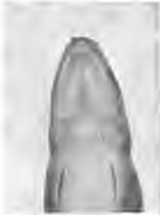
Fig. 1. Ventral view of the head of Polyp-terus . There is no infection and the scales are very clearly defined.