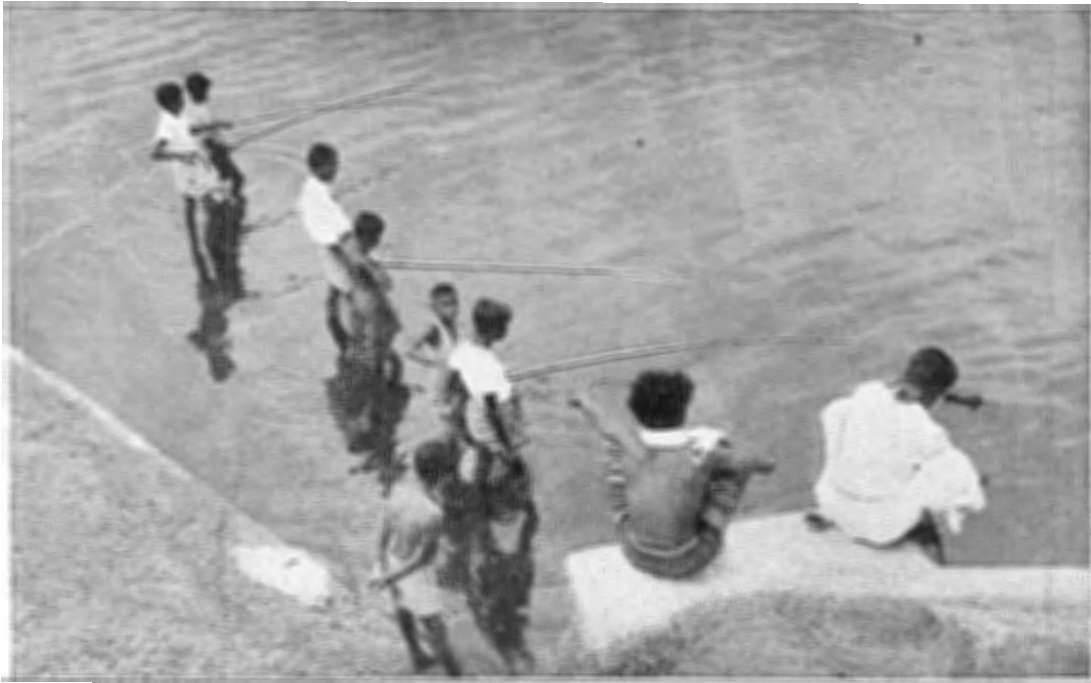
Fig. 2. A group of men and boys fishing for Tilapia in Colombo Lake. This was a familiar scene all round the lake in 1957.