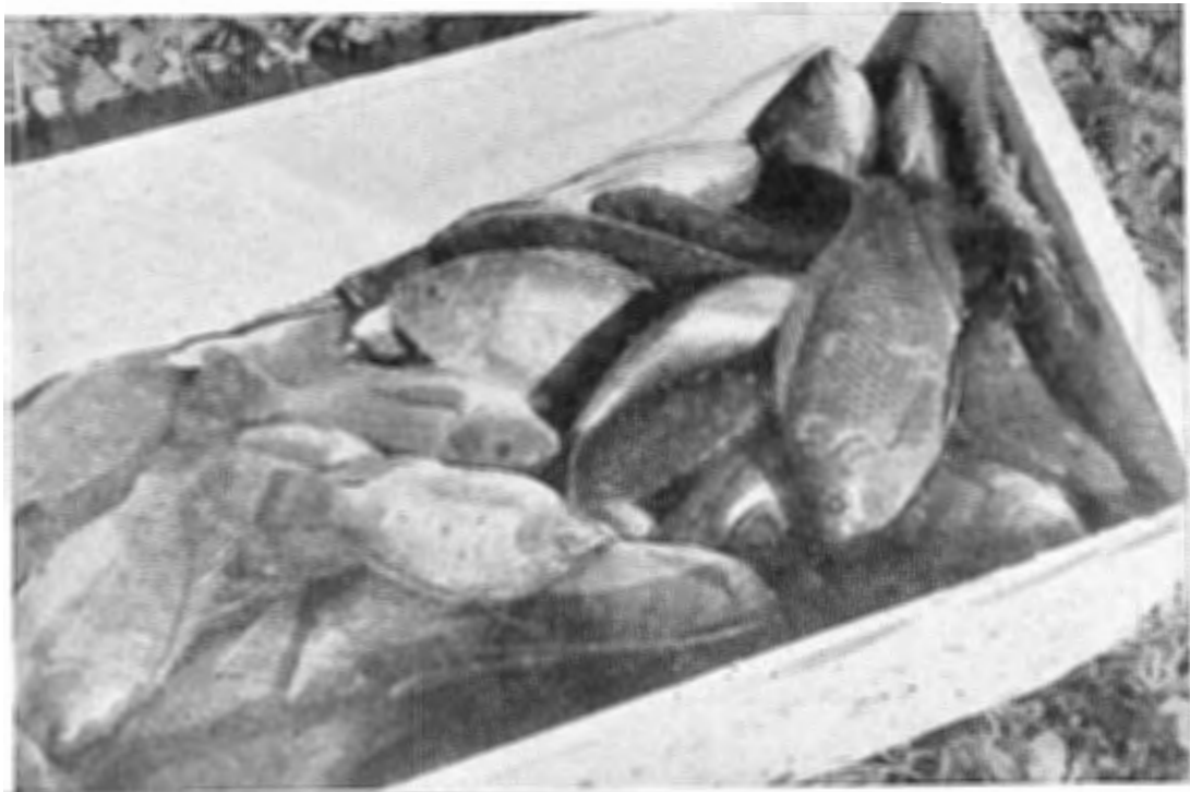
Fig. 3. The fish caught by two fishermen in approximately two hours fishing. The average length of the fish was 17 cms. The total weight of catch was 12 Kg.