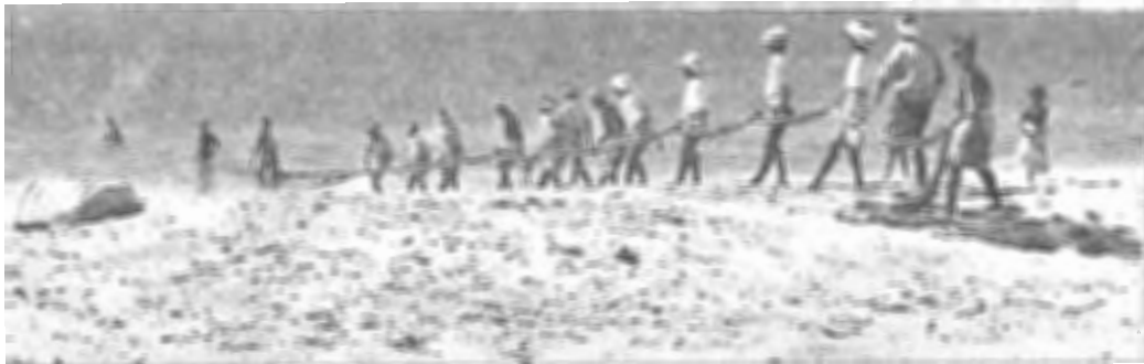
FIG. 4.—A 16-man crew at Sinnapadu half-way through a hauling operation. The whole of the rope and part of the wing have been beached. Three men have entered the water to scare the encircled fish away from the wing into the body 3 . A similar crew not seen in the photograph was working on the other end of the net a hundred yards down the beach to the right. At the left a teppam, turned upside down on the beach, is drying in the sun.

There are two quite different methods of operating beach seines. In most padus the seining is "blind"—that is, the net is set and hauled two or three times a day whether there are signs of fish in the area or not. The quality and quantity of catch from the day's first set usually determines whether further sets are worthwhile. In some places, however, e.g. Marawila on the central west coast, the operation is regulated to take advantage of the appearance of shoals of fish. This seining of shoals is most common when such varieties as paraw, herring and blood-fish (bonito) are being exploited. The surface-feeding habits and migration behaviours of these fish are familiar to the fishermen who have developed special operational tactics for taking them. Spotters are appointed who spend many hours either on the beach or far out at sea on "teppams" (log rafts, fig. 4) watching the surface for signs of shoals of fish. When they feel sure they have sighted a shoal that can be surrounded they signal the waiting crews of the two net boats, who may be on shore or afloat, to come and set the nets. The two types of operation are so different as to warrant the separate treatment accorded them below.