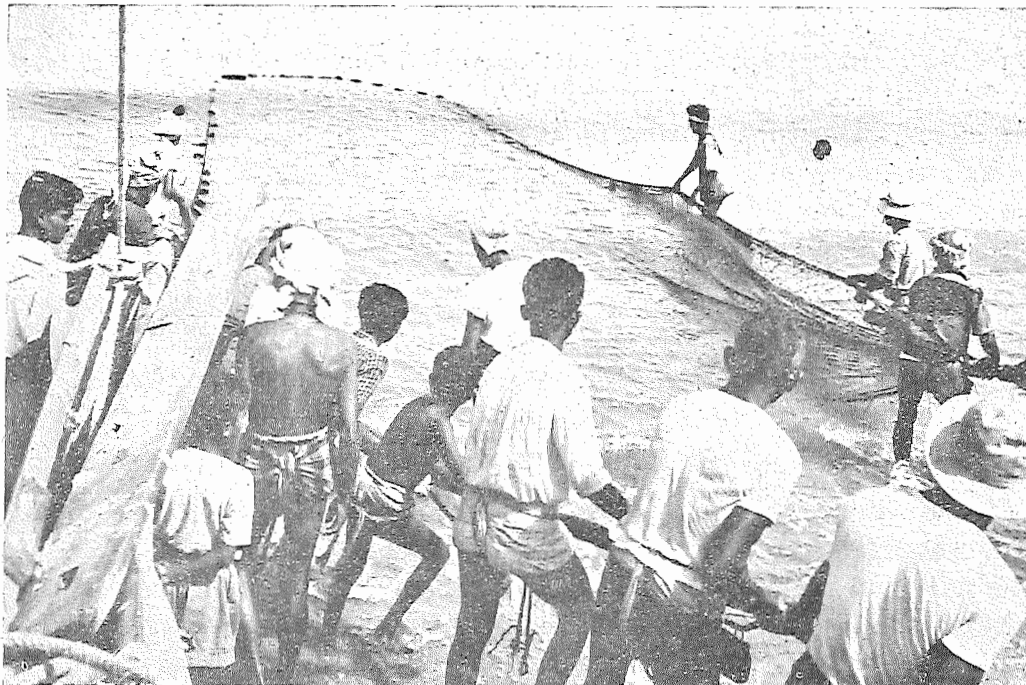
FIG. 5.—A late stage in the hauling of a beach seine at Mutwal near Colombo. The ropes and the greater portions of the coir wings have already been beached. The point of union of the coarse-meshed wing and finemeshed body shows well on the right where part of the net is being held above water. The position of the floats on the body headrope clearly indicates the form of the net as it is hauled through the water

Finally the whole of the body is brought to the shore-line, and the headrope and footrope are raised above the surface and no more fish can escape. Usually the whole body and cod end are carried ashore either separately or in one piece. If the catch is good, however, they are too heavy to be carried thus and spare cod ends are taken into the water and filled with portable loads of fish emptied from the full one until what is left is light enough to be carried ashore. The catches in seining blind usually vary from 10 to 1,000 pounds, or more.