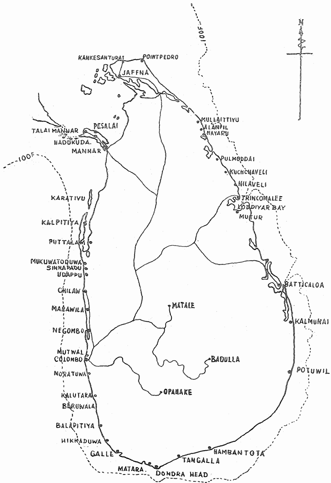
FIG. 3.—Map showing centres of beach seining, the 100-fathom line and railroads