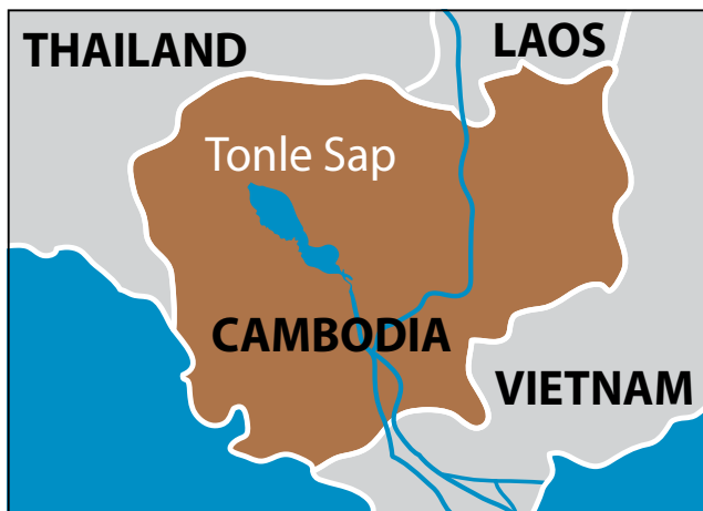
Figure 6. Map of Tonle Sap Lake

The first step in identifying local institutional innovations in the Tonle Sap Lake ecoregion was to support multistakeholder dialogue sessions in each of the focal communities in Kampong Thom Province. These sessions helped local actors to assess their own issues, identify actions within their own capabilities, and make commitments as part of community action plans. As it became clear that the area of public access and community fisheries would be significantly expanded, local priorities shifted from advocacy for increasing access to fishing grounds to making the community fisheries more effective. At the provincial level, the action research team brought together government officials, community representatives and local authorities from Phat Sanday, Peam Bang and Kampong Kor communes. The group discussed issues of common concern, developed action plans, and identified new opportunities for cooperation to aid in implementing the community-level action plans.