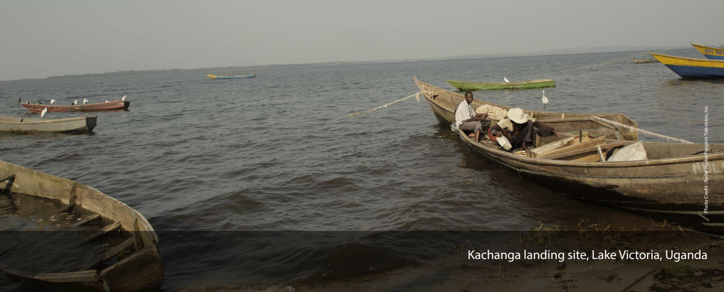
Kachanga landing site, Lake Victoria, Uganda