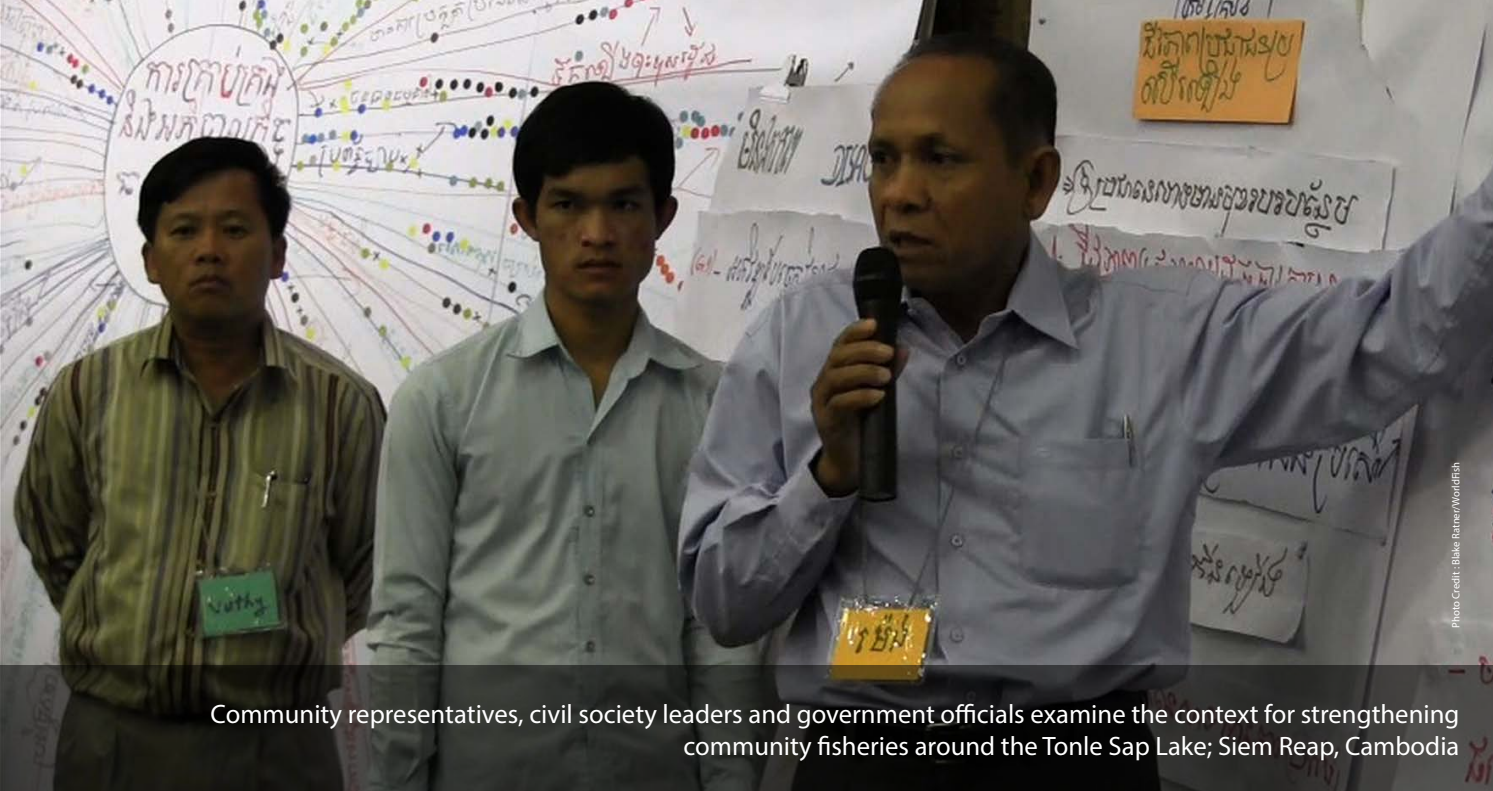
Community representatives, civil society leaders and government officials examine the context for strengthening community fisheries around the Tonle Sap Lake; Siem Reap, Cambodia