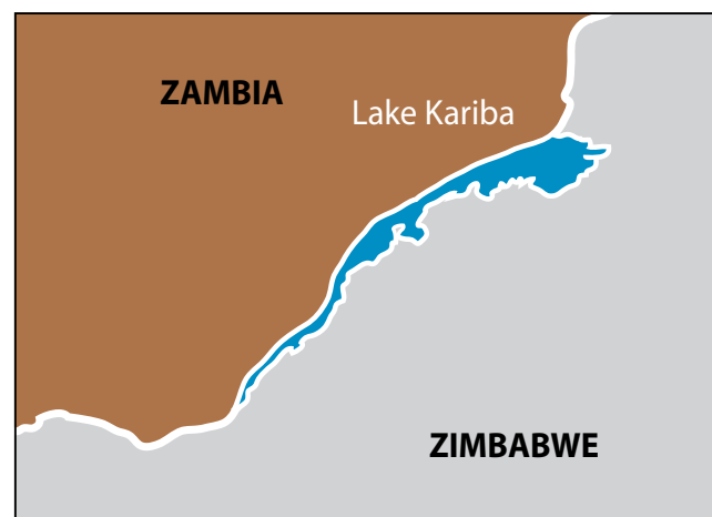
Figure 5. Map of Lake Kariba