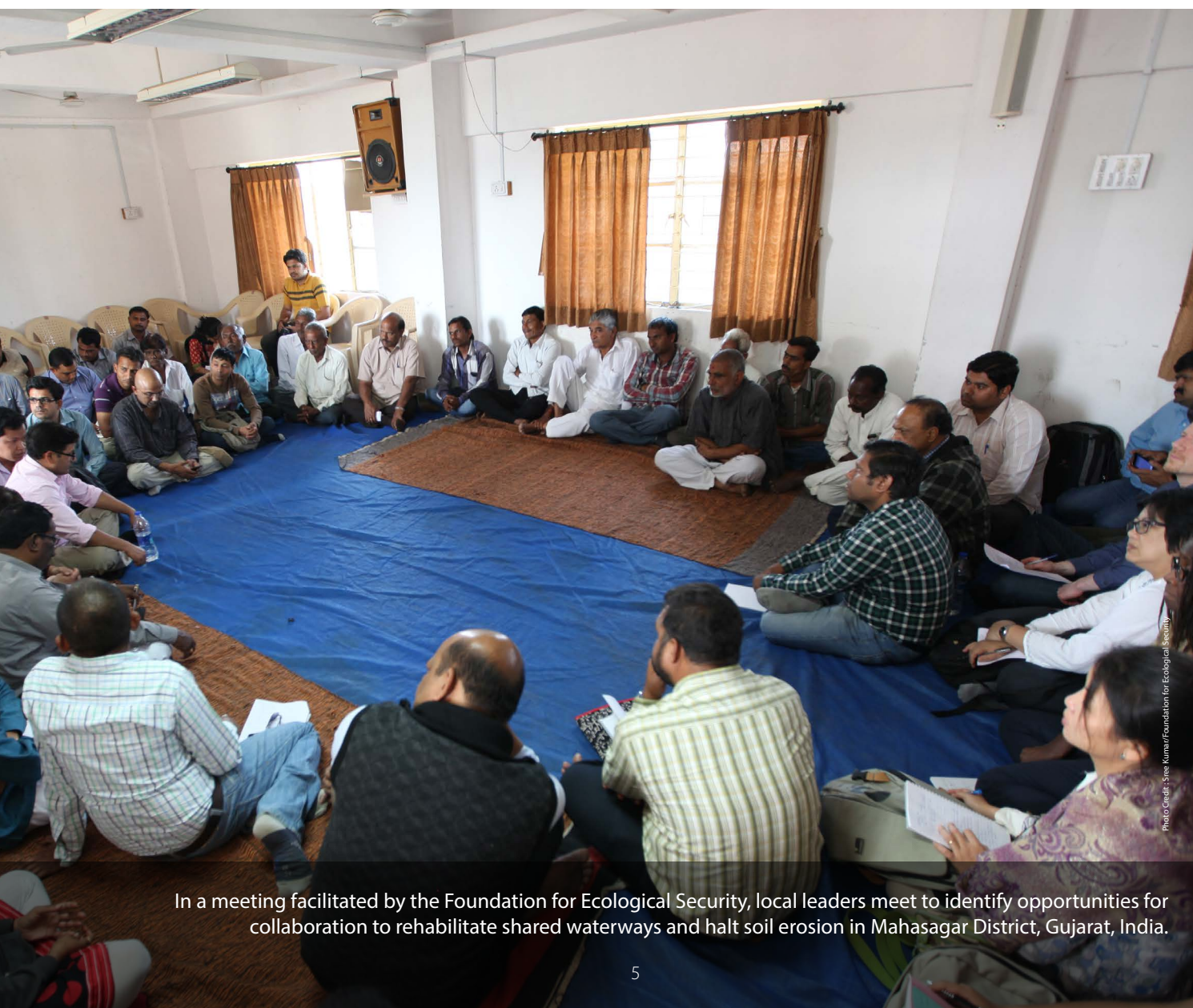
In a meeting facilitated by the Foundation for Ecological Security, local leaders meet to identify opportunities for collaboration to rehabilitate shared waterways and halt soil erosion in Mahasagar District, Gujarat, India.

Research has also shown that natural resources have great potential to foster cooperation, transform or prevent conflicts, and build peace. The sustainable and equitable management of natural resources can prevent conflict, for example, by reducing grievances and building resilient livelihoods. 3 However, as the global population increases, economies develop and cities grow, the demand for natural resources is increasing — as are the negative impacts on the environment. At the same time, environmental change such as global warming is predicted to bring potentially large-scale impacts on water, land and ecosystems. These issues bring new urgency to the quest for approaches that transform the conflict potential of natural resources and harness their capacity to catalyze cooperation.