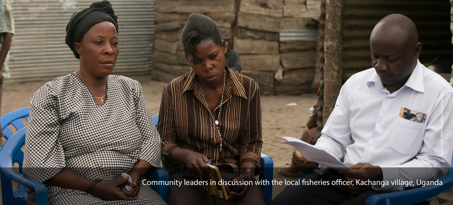
Community leaders in discussion with the local fisheries officer, Kachanga village, Uganda