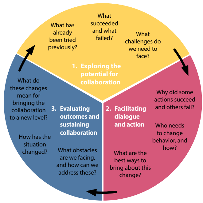
Figure 3. Monitoring and evaluation in the CORE approach to participatory learning and action

The goal was not only to report on outcomes but foremost to foster learning among local stakeholders (see Figure 3). Therefore, the monitoring and evaluation systems were designed in a participatory manner, taking into account that most of the actors involved had little or no experience in the use of such tools. The theories of change, indicators and monitoring activities were defined and implemented by the local partners, including communities, nongovernmental organizations, and government institutions. These activities included structured approaches such as questionnaires, focus group discussions and individual interviews, and narrative descriptions of personal experience such as participant diaries. Research team members convened local stakeholders periodically to discuss and review findings as a means of validation and collective learning.