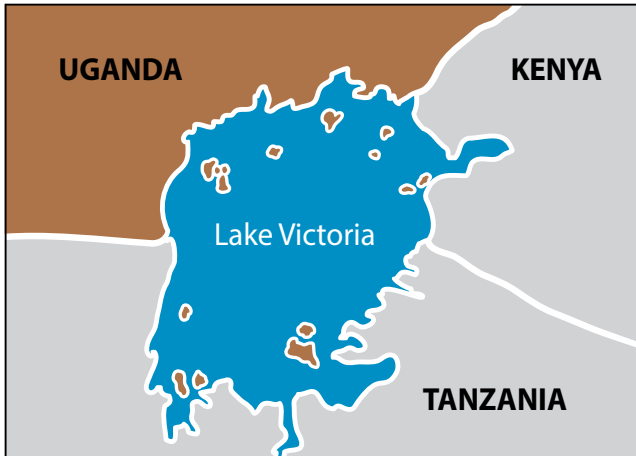
Figure 4. Map of Lake Victoria

In the Lake Victoria ecoregion, stakeholders chose actions they felt would directly reduce poverty and indirectly reduce resource competition in their communities. In the main site of Kachanga, community members sought to reduce fecal contamination to water resources, fisheries and agricultural lands as a way to improve water quality, human health and productivity, and fish health. There, community members, beach management units, the Department of Fisheries Resources, and local and district administrations have worked together successfully to build a new sanitation