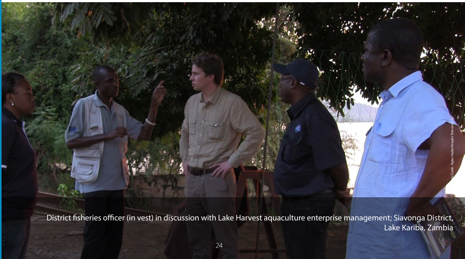
District fisheries officer (in vest) in discussion with Lake Harvest aquaculture enterprise management; Siavonga District, Lake Kariba, Zambia

Successful examples of collaboration can help strengthen mechanisms of accountability over time. As a result of local actions in the Tonle Sap floating villages of Peam Bang and Phat Sanday, the commune councils became supportive of joint patrolling. This strengthened relationships that are helping community fishery committees seek support for the more difficult task of piloting the community-based commercial production model. In Uganda, local actions to improve community sanitation attracted interest from government actors at different levels. The district council's public