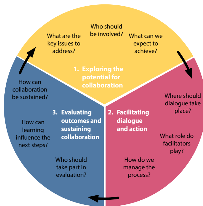
Figure 2. Three phases of the CORE approach

Stakeholders in Lake Victoria were familiar with participatory mobilization meetings, but were not acquainted with multilevel dialogue processes, especially around fisheries governance. Therefore, the STARGO team spent time explaining the broad concepts of dialogue, ownership and agency behind the CORE approach. To address power imbalances among stakeholders, the team organized a preparatory workshop to give community participants the opportunity to make their voices heard and to enhance their capacity to engage other stakeholders. This was followed by a multistakeholder workshop bringing together government representatives from various levels alongside representatives of three lakeshore and island communities, and later, smaller meetings to review progress.