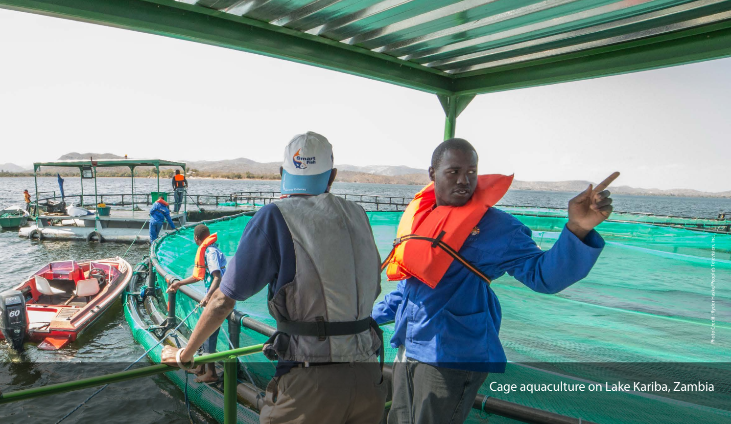
Cage aquaculture on Lake Kariba, Zambia