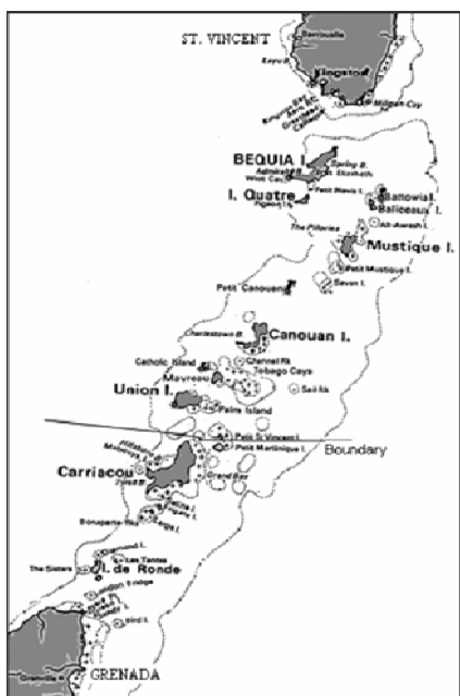
Figure 1. Geographic location and detail of the trans-boundary Grenadine Islands of the Grenada Bank ( Adapted from Sustainable Grenadines Project 2005 ).

in recent years. Overfishing, coastal habitat destruction and degradation, sedimentation, solid waste, and sewage disposal from land-based and boat sources, as well as the recreational abuse of coral reefs have been cited as causative factors for this deterioration (CCA 1991a, b, Price and Price 1998, FAO 2000, FAO 2002, ECLAC 2004, Sustainable Grenadines Project 2005, Williams et al. In prep).