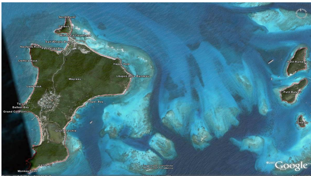
Figure 4. An example of how the basemap was annotated with local ‘topogy’ supplemented with Google Earth satellite imagery in order to aid stakeholders’ recognition in mapping exercises.

By actively involving stakeholders in each step of the research process, encouraging collaboration on methodology applied and possible solutions to management issues, the research aims to foster an equitable and transparent atmosphere. A transparent adaptive research framework is fostered through the utilisation of validation, feedback and evaluation mechanisms thereby encouraging further