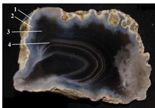
Figure 1. Concentrically zonal agate of Tersyuk district: 1 – cristobalite and quartz ( K_{ci} = 1,8 ), 2 – chalcedony ( K_{ci} = 1,2 ), 3 – chalcedony ( K_{ci} = 1,5 ), 4 – chalcedony ( K_{ci} = 2,9 )

Layer-by-layer X-ray diffraction study of minerals which make up separate layers in agates and onyxes allowed proving three minerals presence: chalcedony, quartz and (less often) cristobalite. The latter was found in Tersyuk agates (figure 1).