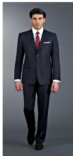
Fig. 5. «Alex» line suit «Voronin exclusive». Wool+adzes SUPER 100’S

«There is an English, French and Italian fashion, but I’m an admirer of classics that balances between English and Italian style» – Voronin said. The specificity of a classical suit is in its convenience, when you’re not tired and don’t feel like taking off your coat while working in an office. Besides, Voronin suits are ecologically save articles. A complex of measures is taken while its production, starting from water