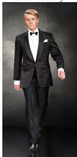
Fig. 4. The suit of «Voronin DeLuxe» collection with hand-made elements. The cloth SUPER 220’S

The production is concentrated on different groups of population and the main segments of the market therefore its output is set up for producing several lines of clothes. “De Luxe Men” collection is designed especially for a business and political elite of high and middle range. “Exclusive men” collection and a separate shop were created especially for customers with high level of an income. This collection has a limited edition because of the exclusiveness of an expensive cloth and handmade elements of fabric. Simultaneously from 2011 together with “Voronin” concern there are women collections “De Luxe Women” and “Exclusive Women” and collections for wide sections of the population as “Classic”, sportswear collection “Sport”, shirts, ties, knitted wear, lingerie, accessories, perfume. There is a particular price policy for each collection as its necessity is time-approved.