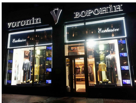
Fig. 18. Branded shop «Voronin» in Kiev