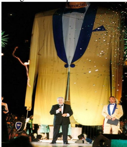
Fig. 10. x1000 size tuxedo

The separate word should be said according Mihailo Voronin's brand strategy promotion. Participating in traditional shows as "Ukrainian Fashion Week", and having his own in Ukraine and abroad he resorted to the extraordinary measures. On September 8th in 2012 a giant tuxedo was designed and presented at Kiev's central street Khreshchatyk. It was in 2002 in Paris at designer's forum when Voronin has heard a thought that a tuxedo can be sewed successfully from 48 to 58 sizes. Such a thought pushed him to think of advertising campaign. After some time, a giant tuxedo of 1000 size was ready. Using the colours of the Ukrainian state flag, blue and yellow, had been a symbol of a tuxedo as a garment of British origin but produced in Ukraine. To create this, the whole factory team was working for 64 hours. To make this idea come true the 174m. of Italian fabric was used, 126 m of linings, 146 m of diablerie, 30 m of collar, 30 thousand hrv was spent for its creation. The buttons are 35 sm. in diameter. The tuxedo was lifted for the buttons sewing with the help of the hoist.