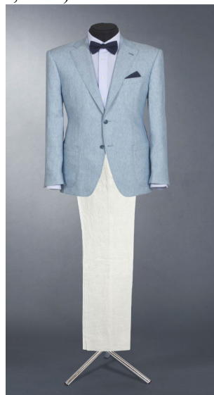
Fig. 7. Suit «Biarrts» line «Voronin classic». Linen