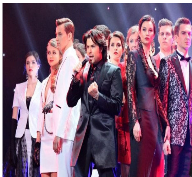
Fig. 15. The show cast of the last life collection of the evening outfit from «Voronin» performed by «The Show Must Go On», 2012

Creating the fashion collections he tried to change the philosophy: his suit is available for fit and young as well as for men with non-standard figures of any size or age. Voronin sets a classical style and an excellent taste starting from the student's age. He established a student's movement "Student" that is hold in the of higher education establishments. Thus, a classical suit is worn by those who considered it to be too official.