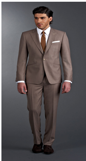
Fig. 6. Youth suit «Rokko» line «Voronin classic». Wool+adzes SUPER 100'S

Construction and materials and especially equipment and organization of enterprise were the object of the study in Europe. «When I became the holder of a controlling packet of the factory, first of all I visited home and foreign enterprises in order to improve the production and the work». Nowadays the factory is completely supplied with particular equipment of foreign companies’ production of Germany, France, Switzerland, Sweden and Japan such as “Pfaff”, “Durkopp”, “Test”, “Union special”, “Strobel”, “Juki”. It is also equipped with a set of cutting and preparative tools and presses of “Indurpress” and “Mayer”(Germany). Information processing and software are put into practice with the help of a local computer web “Netwear” (USA). Home materials and equipment are not used on an enterprise. “Today English and Italian clothes are considered to be the best. Apart from English and French, Indian, Chinese and Yugoslavian fabrics are used.” Applied materials are just from the leading producers : “Lenor de PekAarde”, “Jabu-Ley”(France), “Henzel”(Germany). As Mikhail Voronin states: “We have to travel around the world and bring the best” (Trade Business, 2004).