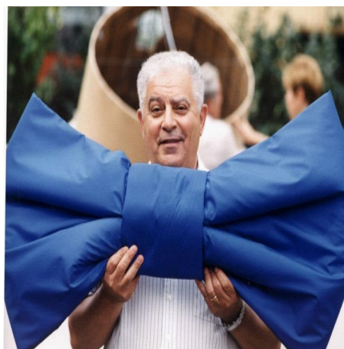
Fig. 11. Giant tie-bow and mannequin are registered records

The presentation of a world-record holder was a vivid event in the history of fashion brand. A giant tuxedo was listed in the Guinness Book of Records as all the demands were kept.