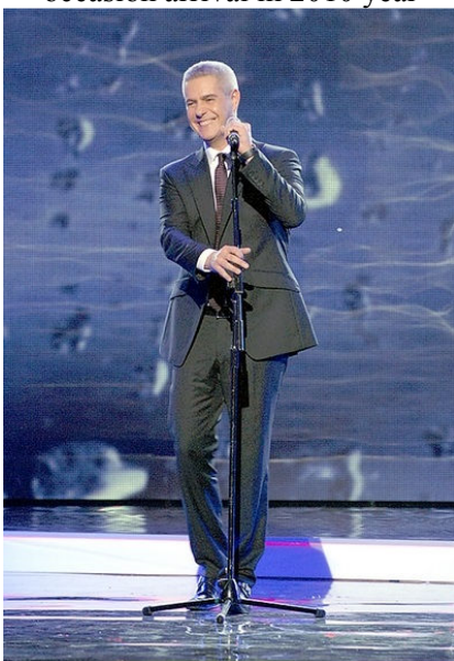
Fig. 14. Italian tenor Alessandro Safina dressed in suit from «Voronin»