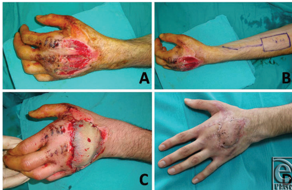
Figure 7. (a) Dorsal hand defect in a 28 years old man. (b) Flap transposition. (c) Early postoperative result. (d) Late postoperative result.

sacrifice of a major artery that may jeopardize hand viability. The radial forearm perforator flap, which preserves the radial artery and prevents the need to sacrifice the radial artery, is described for covering moderate-sized hand and wrist defects. 8 It cannot be stated that the RARFF is superior to the radial forearm perforator flap. However, in this article, we tried to minimize the disadvantages of a traditional reverse radial forearm flap arising from a skin graft to the donor area. One of the major disadvantages of the forearm flap is its significant donor site morbidity. 9 The most frequently reported donor site problems are delayed healing of skin graft, adhesions, edema, contracture, and sensory changes. To minimize donor site complications, the use of tissue expansion and artificial dermis is advocated. 6,9-11 Morbidity of a donor site must be taken into consideration when planning hand reconstruction.