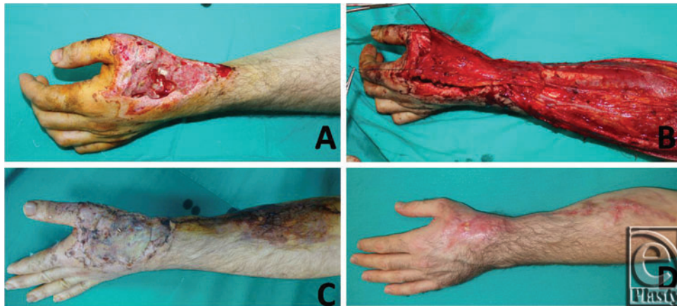
Figure 6. (a) Dorsal hand defect in a 31 years old man. (b) Flap transposition. (c) Early postoperative result. (d) Late postoperative result.