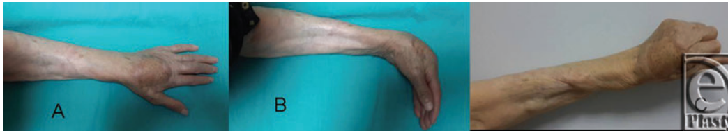
Figure 2. (a-c) Late postoperative results of the patient whose surgical details are explained in Figure 1.