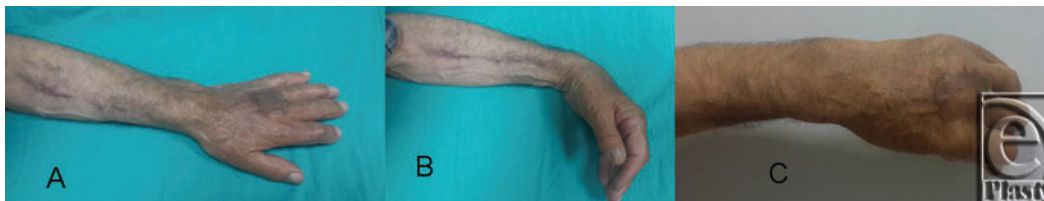
Figure 4. (a-c) Late postoperative results of the patient whose surgical details are explained in Figure 3.