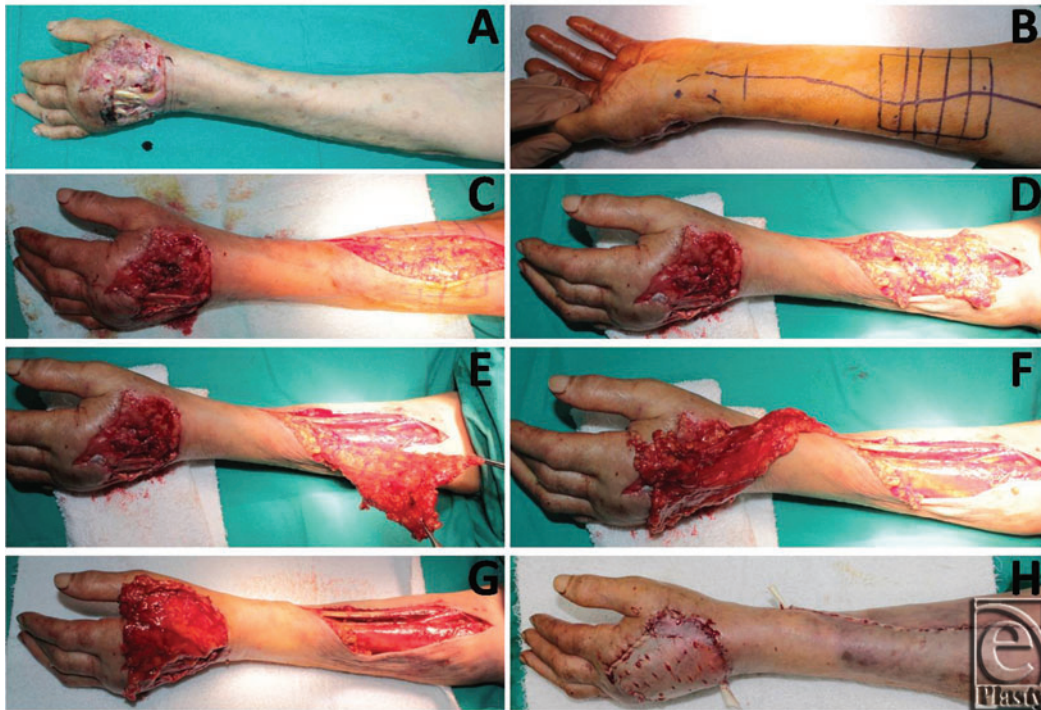
Figure 1. (a) The defect of the dorsum of the hand in a 67 years old woman. (b) Flap dimensions are designed according to the size of the defect. (c) Skin incision. (d) Exposure of adipofascial tissue. (e) Dissection of the vascular pedicle. (f) Dissection precedes the radial styloid. (g) Flap adaptation on the defect area. (h) Graft adaptation over the flap.

To evaluate patient satisfaction, a 100-mm visual analog scale (VAS) was used. The VAS ranged from 0 mm for unsatisfied to 100 mm for very satisfied .