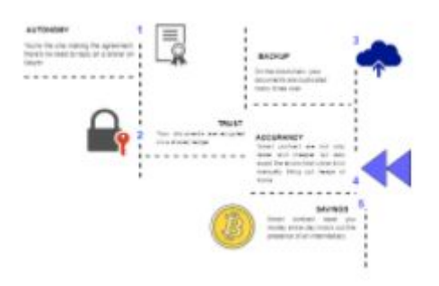
Figure 2. Benefits of implementing Smart contracts.

An open-source blockchain, Ethereum executes Smart contracts. Very secure, its blockchain database, stores smart Contract transactions, including the source code. Developers use Solidity to write Ethereum smart contracts. This high-level programming language helps developers write Smart contracts that run on the Ethereum Virtual Machine (EMV) [14]. In the Ethereum database, Smart contracts exist as bytecodes. This code forms the core of Ethereum's disruptive power and innovative potential.