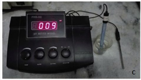
Fig. 2. a) pH strips in stimulated and unstimulated salivary sample (left cup pH 7, right cup pH 6). b) Universal indicator pH paper strip. c) Electronic pH meter.