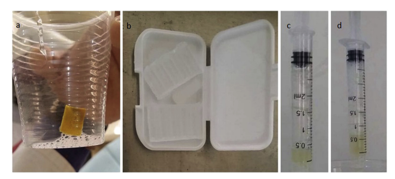
Fig. 1. a) pH strip in thick consistency frothy salivary sample. b) Paraffin wax pellets. c) Saliva sample in a graduated syringe (0.3 ml/min). d) saliva sample in a graduated syringe (0.7 ml/min).

Age is the only factor which is significantly affecting dental