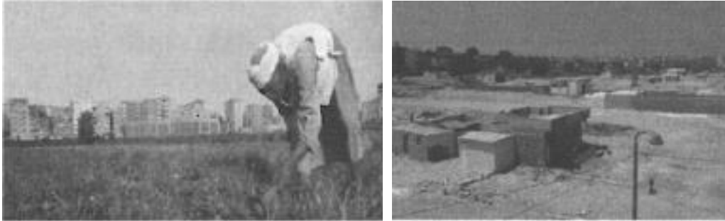
Picture 2: Few agricultural lands infiltrated in the illegal urban expansion in the peri-urban areas.

owned, group transportation measures like mini buses and the like. lv However, some exceptions to this pattern exist. On some occasions, decisions are taken to establish industrial establishments, warehouses, junkyards, and wholesale structures on agro-land. Reasons for these decisions were the proximity to large and cheap lots and the adjacency of these lots to the inexpensive labors. In such cases, those projects usually attract, in additions to peasants living around, some of the urban poor population who pursue close-to-the-city shelters but could not afford expensive formal housing. These rural-urban linkages that work as interactions of two-way flows contribute to diminish variances between the rural and per-urban urban interfaces and create "urban villages" or "rural cities" where boundaries between both settings are blurred and hard to define.