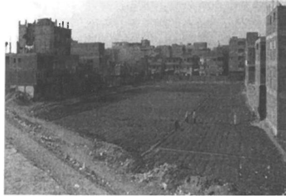
Picture 1: The infiltration of agricultural lots within illegal new urban settlement North of Cairo.