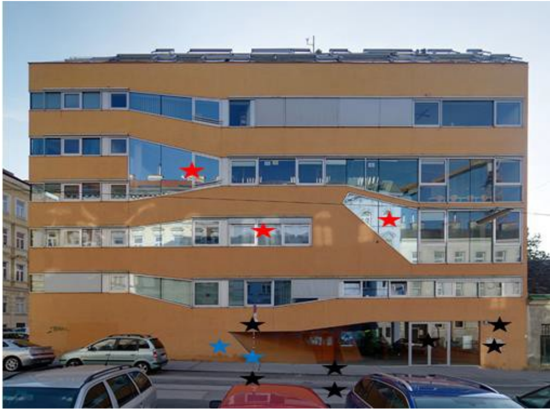
Fig. 1 Salient Cues in Miss Sargfabrik (Austria) Reference : Miss Sargfabrik.