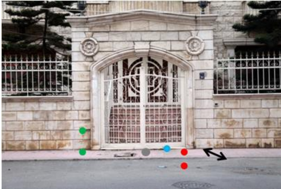
Fig. 4 The Building Approach of Hammoud House (Mount Lebanon) Reference : The author, Photo by Mohamed Khairuddin, and Maha Erfan (2018)