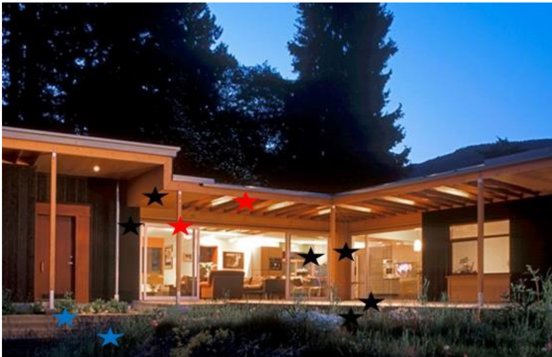
Fig. 2 Salient cues in Siple House (Canada) Reference : Siple House (2004)