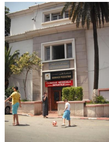
Fig. 6 Outdoor spaces. A space of potentialities