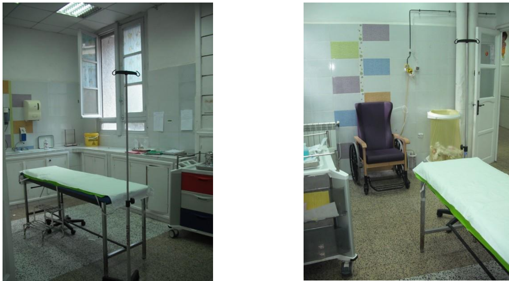
Fig. 4 The medical care room a space felt with fear Reference: Author, February 2018

Children express pain, tears, fright and silences when talking about the medical care room. They avoid going inside it. It is only used when medical treatment or nursing services are needed. The space is neutral: no ornaments and no colours. 100% of children (boys and girls) describe the feeling of being in danger on the space. Even if the parents accompany them or the medical staff reassure them during treatment times. They express the fear of the space.