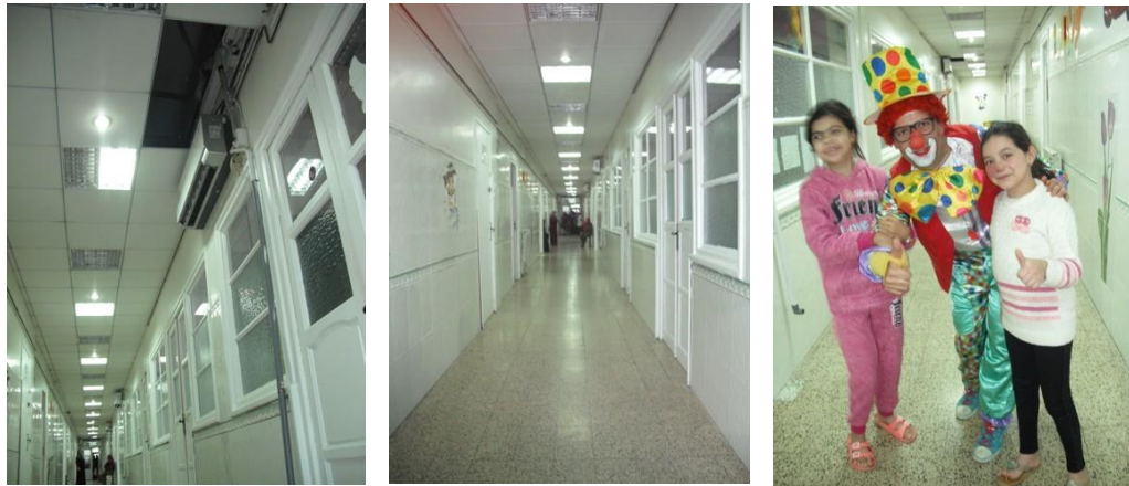
Fig. 3 The corridor is an important space of interaction between spaces and users. Reference: Author, February 2018