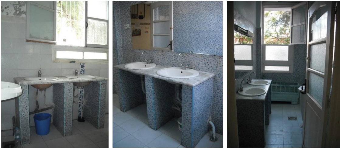
Fig. 5 The medical care room a space felt with fear Reference: Author, February 2018