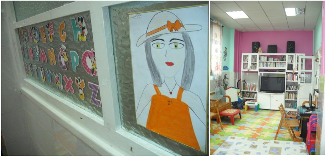
Fig. 1 The Playroom is a major space used by the child. It is personalised with creative and artistic child realisation. It offers security, calm, joy and vitality to children.

learn and to laugh. They have the possibility to personalize the space with personal drawings and paintings. They regret the inaccessibility of the space during all the day: it is only opened from 10 to 16 due to administrative matters : availability of the psychologist in charge of the space ( figure 01).