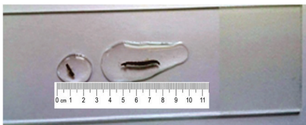
Figure 1. The fourth stage Psychoda albipennis larvae on glass slide

The patient was discharged and recommended to drink plenty of water and prescribed a urinary tract antiseptic to interfere with any secondary bacterial infection. A month later, the patient was followed up and large number of grayish worms were reported dead and discharged in the urine, clinically, abdominal pain and discomfort were disappeared.