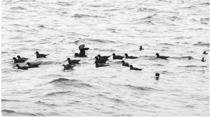
Fig. 2. Raft of black petrels with 1 Galapagos petrel and 5 white-vented storm-petrels.

white-vented storm petrels and other taxa actively foraging in this area.