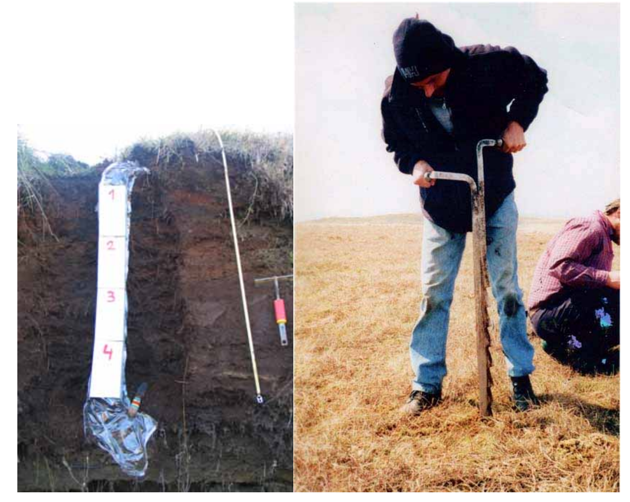
Figure 4. Left: collecting peat in north-east Iceland, from an exposed surface containing tephra. Note the difference in colour between the long-term exposed peat face (lighter, more oxidised) and the darker, newly cut surface. Right: using the peat cutter of Lageard et al. (1994) to cut a trench in a peatland. This type of cutter can also be used on peat haggs.