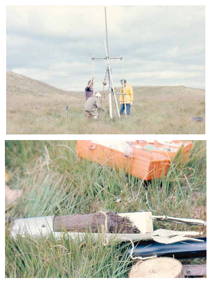
Figure 3. The large-capacity hand corer of Smith et al. (1968). Above: general view of the rig and corer in use; below: plastic liner containing a minimally compressed peat sample.

failure of the corer to penetrate the vegetation mat, it is recommended that the surface layers should be removed (i.e. sampled, as described in Section 3) before commencing the drive.