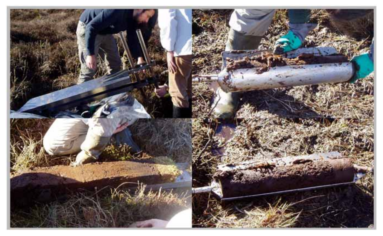
Figure 2. The two main types of corer that are used for sampling peat profiles. On the left, the Wardenaar corer and the peat monolith that can be retrieved with it. On the right, the Russian D-corer and the semi-cylindrical sample that it delivers.

To obtain a sample using a double-blade corer, the two blades are separated and one of them is pushed vertically into the peat to the required depth, cutting round only part of the monolith's perimeter so that it is still partly supported by surrounding peat whilst the first cut is being made. The second blade is then inserted so that it cuts the remaining side(s) of the monolith; then the two blades are lifted together, with the monolith enclosed between them.