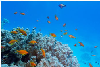
Figure 5: Illustration of a scene showing a multitude of fishes from the movie (example only).