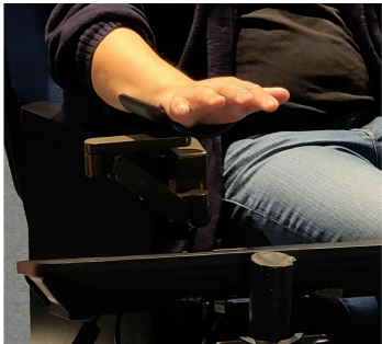
Figure 8: Improvised wrist rest.