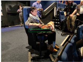
Figure 2: A participant during the Exploration user study (WP1). The STRATOS Inspire is highlighted in green and the props in red.

“create an aquarium dedicated to conserving and building Natural Capital (Nature and Nature’s services) by building Social Capital (the interactions between and among peoples)” [1].