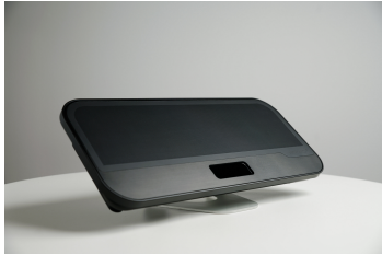
Figure 1: STRATOS Inspire by Ultraleap