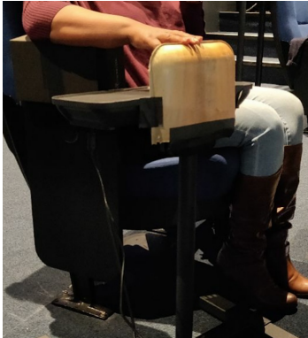
Figure 7: Improvised fingertip rest.