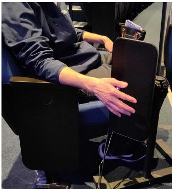
Figure 9: Idea of placing the UL array vertically.

to the video during \mathcal{V}_M . The four participants who enjoyed the haptics preferred \mathcal{V}_M , the clip in which the sensations were associated with the visual imagery.