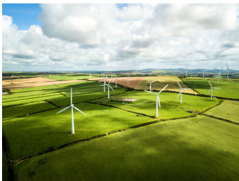
Figure 6: Illustration of a scene showing wind turbines from the movie (example only).