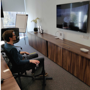
Figure 4: Setup at Ultraleap headquarters.