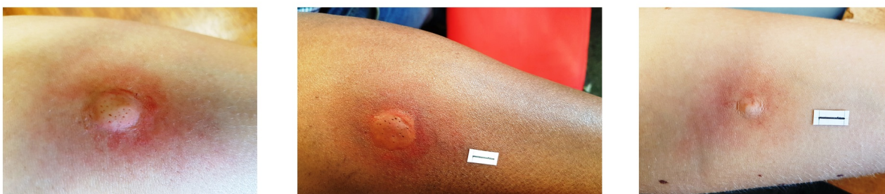
Figure 1. Examples of the mock skin indurations produced using special effects makeup.