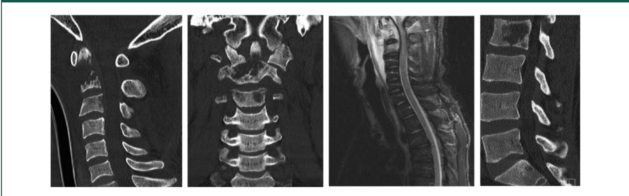
Figure 1. CT and MRI imaging.

be on standby to operate without delay due to the patient's clinical status. The patient remained intubated and underwent emergency C1/C2 decompression and occipito-cervical fixation 3 h post admission at 5:30 am.