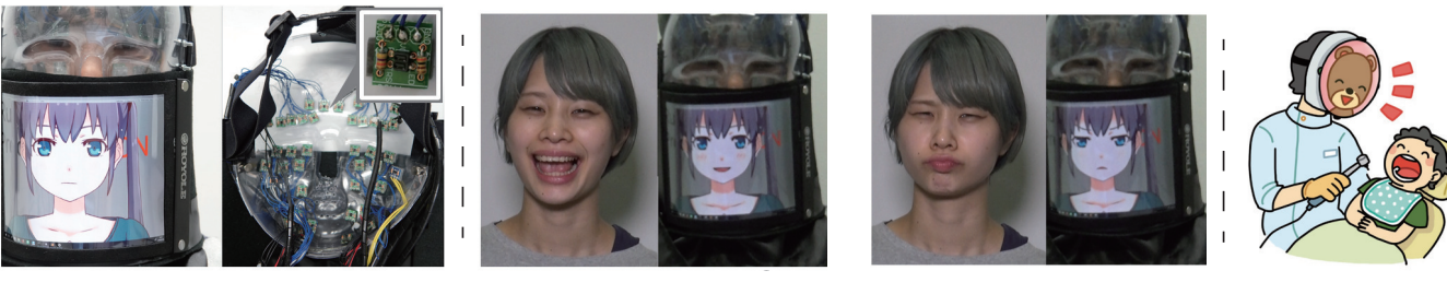
Figure 1: (Left) Face display mask and Face capture mask, (Center) The user's facial expression is reflected onto the avatar, (Right) Usage Image of e2-MaskZ

Masafumi Takahashi Hiroaki Taka Keiji Hirata g2118022@fun.ac.jp {taka,hirata}@fun.ac.jp