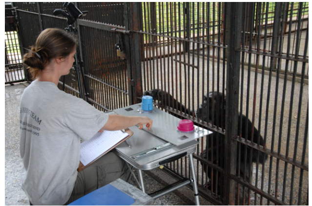
Figure 1. General setup with covered safe option (blue/tall cup) and risky option (pink/shallow cup). The centres of the two plastic lids on which the options were presented were 42 cm apart.

Chimpanzees were tested individually in their familiar sleeping rooms. The experimenter (E) presented two choice options hidden under two different cups on a table in front of the testing room (figure 1). The 'safe' option always held three pieces of apple; the 'risky' option either held six pieces of apple or none with a 50%