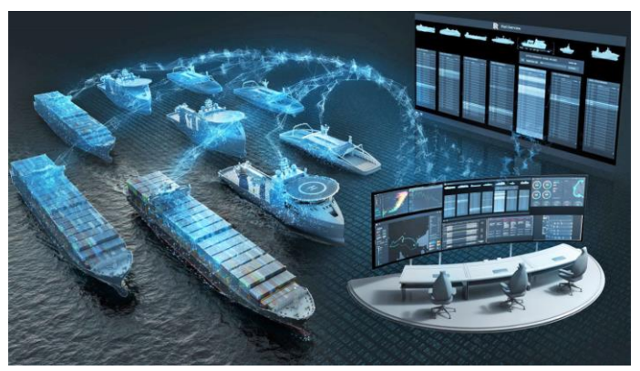
Fig. 1 : An conceptional illustration of big-data-oriented shipping (CIAOTECH Srl 2019).

improve shipping efficiency and reduce emissions. Moreover, this process can be automated along with the update of data in real-time.