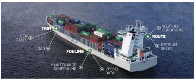
Fig. 3: Demonstration of variables for ML optimisation (GreenSteam 2019)

In recent years, with the benefits of reducing marine incidents as well as optimising energy efficiencies, there have been increasing deployments of automated route planning which is currently supported by weather routing systems and radar systems. In this approach, environmental factors such as the wave height, direction, wind and currents as well as densities and temperatures of air and water are considered, while radars are normally used to identify other vessels and obstacles to secure safety.