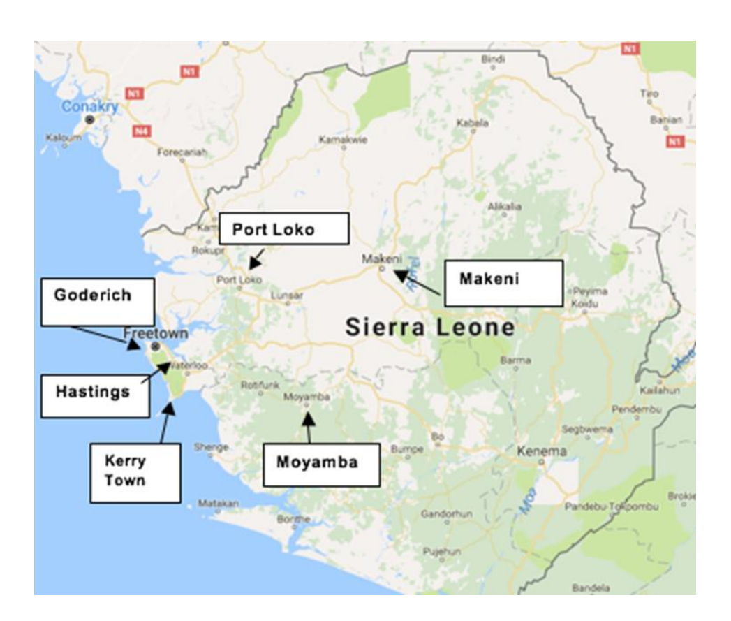
Figure 2 – Map showing the location of 6 DfID funded ETCs in Sierra Leone (Google, 2017)