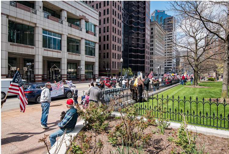
Fig. 3 Columbus COVID-19 protests at the Ohio Statehouse, USA, 18 April 2020. Taken from https://upload.wikimedia.org/wikipedia/commons/thumb/5/5e/Columbus_coronavirus_protests_at_the_Ohio_Statehouse%2C_2020-04-18a.jpg/1280px-Columbus_coronavirus_protests_at_the_Ohio_Statehouse%2C_2020-04-18a.jpg