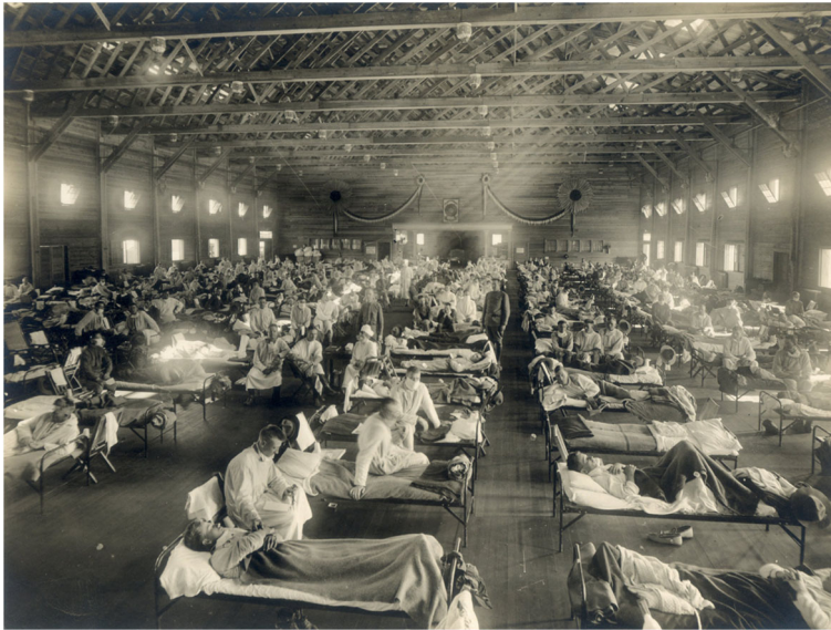
Fig. 1 Camp Funston, at Fort Riley, Kansas, during the 1918 influenza pandemic.

There are interesting parallels with COVID-19, which Donald Trump, of course, has more than once referred to as ‘the Chinese virus’. Less well known is the story behind the World Health Organization calling the virus ‘the COVID-19 virus’. Viruses are named by the International Committee on Taxonomy of Viruses (ICTV) who have named the causative agent for COVID-19 ‘severe acute respiratory syndrome coronavirus 2’ (SARS-CoV-2). However, as the WHO explains: