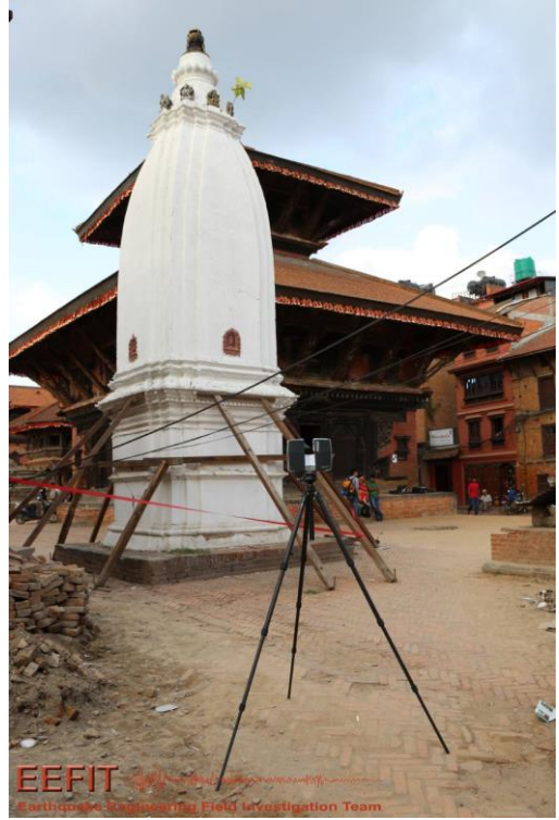
Figure 1. A point cloud of Nepalese temples after the Gorkha earthquake captured using a terrestrial laser scanner and a photographic image of the same