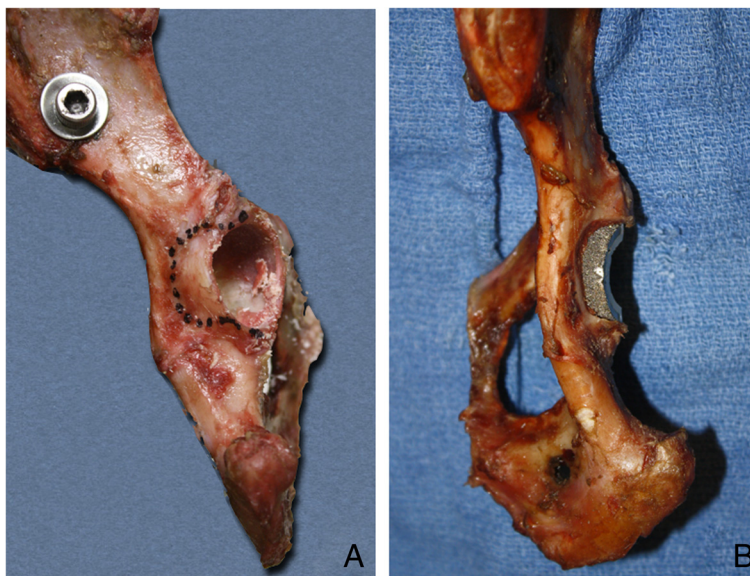
Figure 3 A hemipelvis specimen with the level of dorsal acetabular rim resection outlined with a permanent marker (A), and after dorsal acetabular rim resection and impaction of the BFX acetabular prosthesis (B).