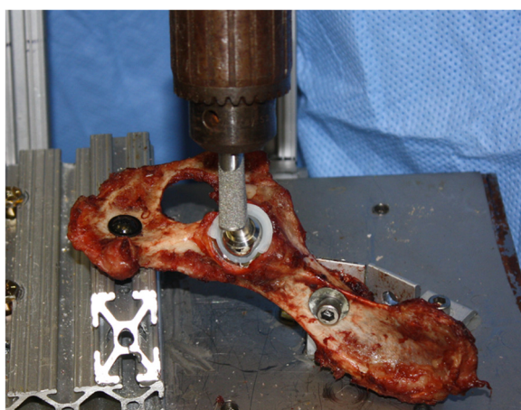
Figure 4 Specimen testing set up of the hemipelvis with implanted acetabular cup loaded to failure at a standing angle using a prosthetic femoral head and stem.

Our study utilized two ex-vivo methods of evaluating the integrity of the BFX cup – bone interface. Both cadaveric specimens and polyurethane foam blocks with similar mechanical properties to cancellous bone [12] were used. The resistance generated between the cup and foam block