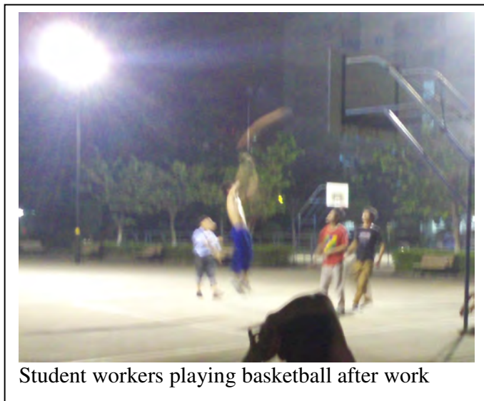
Student workers playing basketball after work

Underage workers - There are a large number of underage workers at the factory, who are assigned to the Assembly department. The factory cooperates with several technical schools to send new students to work at the factory, and presently students from Guangzhou Xincheng Technical School work there. These students come because their