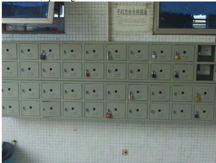
Phone Charging Area