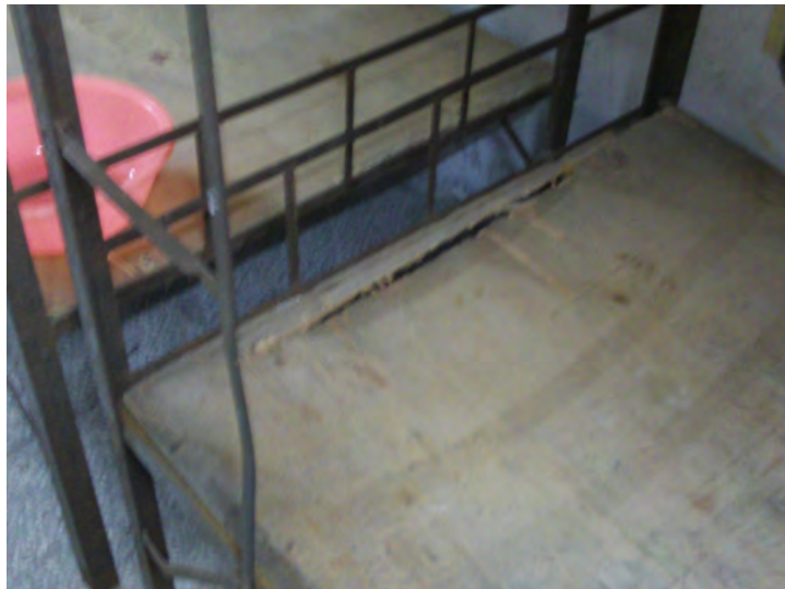
Bed board, splitting

The dormitory rules state that workers can only air out their quilts and