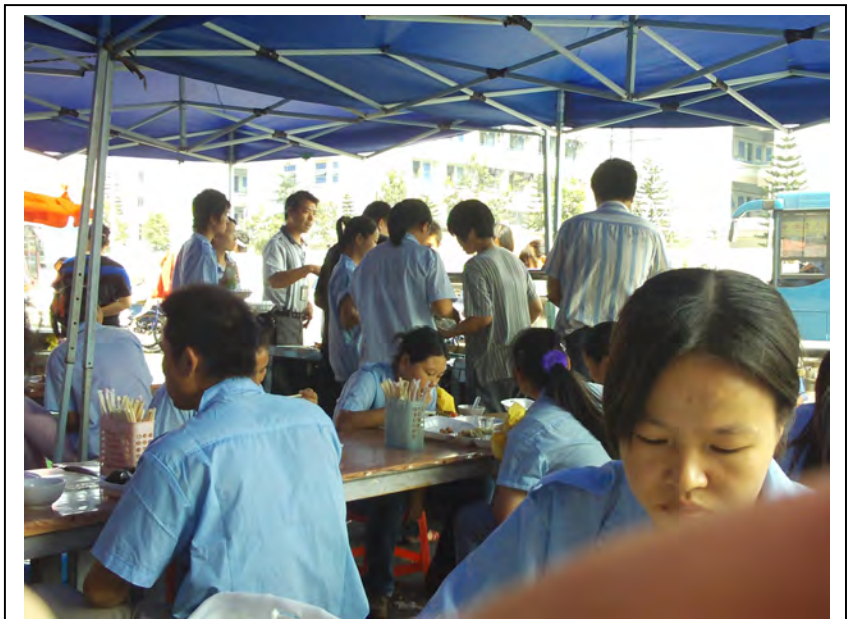
Workers eating outside the factory