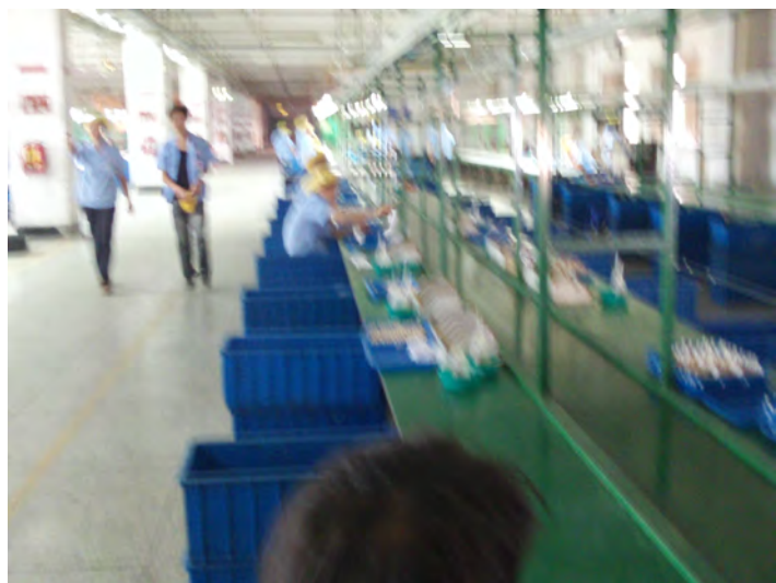
Assembly Department Workshop