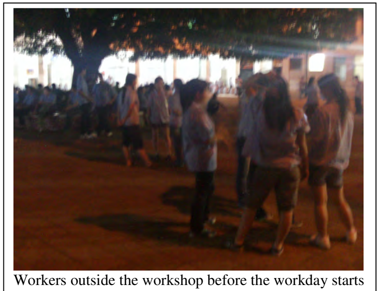
Workers outside the workshop before the workday starts

The labor contract is signed 3 months after hiring. The contract is for 3 years, with a 3 month probationary period. There are two copies of the labor contract, and both the factory and the worker get a copy. There are, however, exceptional cases; one worker, who had worked at the factory for four months, signed two copies of the contract and the factory retained both.