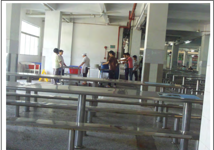
Factory Cafeteria environment

The canteen offers 3, 4 and 5 RMB ($0.44, $0.58, $0.74) packaged meals. For 3 RMB ($0.44), workers get one vegetable and one meat dish and for 4 RMB ($0.58) another dish is added. Workers all feel the food smells badly, and many workers would rather go outside to eat. Outside, fast food restaurants offer 2, 3, 4 and 5 RMB ($0.29, $0.44, $0.58, $0.74) meals, but sanitation is generally poor.