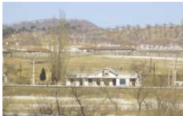
A North Korean train station near the Chinese border.

going through their menstrual cycle. After we cleaned our bodies, then we had to use the same water to clean the floor of the room. Then finally the water was used to flush the toilet. 66