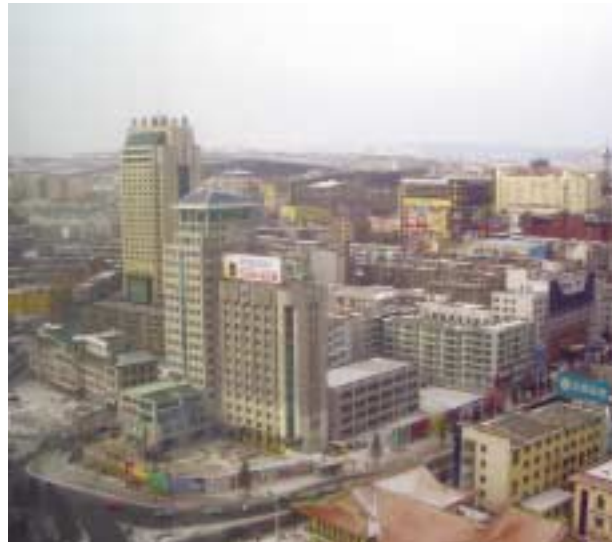
The city of Yanji, capital of Yanbian Korean Autonomous Prefecture in China.

Most interviewees were by and large still content to continue living in China, as they are in close proximity to North Korea where many of their family members still reside. Some, however, find living in China too stressful because of the insecurity and the need to constantly guard their behaviour. The South Korean Government's policy of extending citizenship to North Koreans offers these border crossers in China something they have longed for: legal status. Through regularisation, border crossers would be able to "live without fear and have peace of mind". As a Kyongsong resident pointed out: