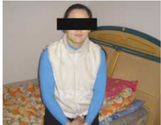
A North Korean interviewee.

We were sent to building construction sites where we carried, in pairs, stones and cement. I was hit a lot - all over my body - because I was not walking fast enough. My legs hurt a lot so I couldn't keep up with the others. Only the prison guards hit us, not the team leaders. I also weeded in the cabbage patch. I was hit for various reasons