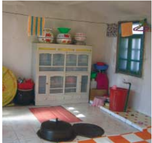
The kitchen of a rural farming household in Jilin Province.

Like the 38-year-old, many women who travel to China have aspirations of finding a job and sending money to their families. But once they arrive, they realise that earning money in China is not as straightforward as they previously believed. Their relatives or people with whom they stay inform them that it is dangerous in China and the best way to survive is through the protection of a man. From that point on, the women are easily convinced that they would be better off getting married to a Chinese man. They