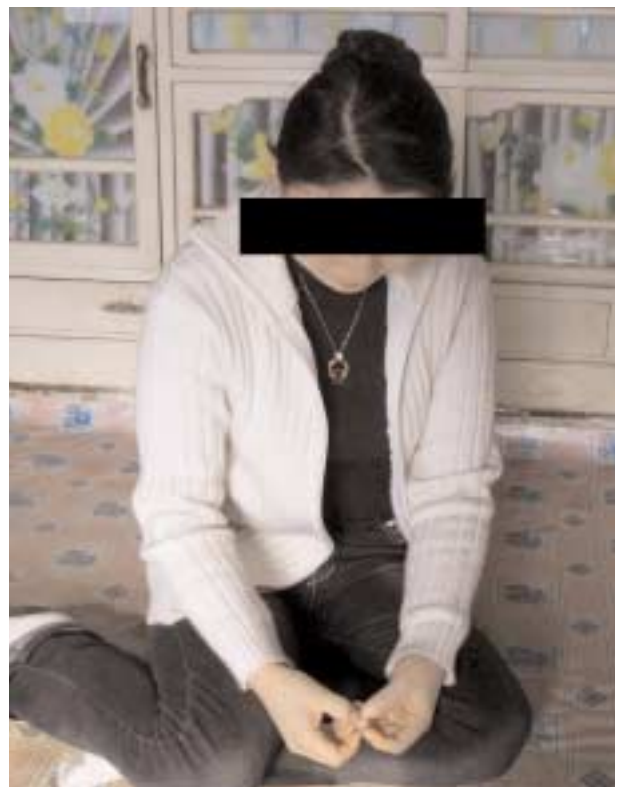
A North Korean interviewee.

Prisoners invariably undergo a more intense and extended interrogation process when they are caught at a Chinese border area with a third country (e.g. with Mongolia or Vietnam), as it is assumed that they are seeking to defect to South Korea via a third country. A case in point is a 21-