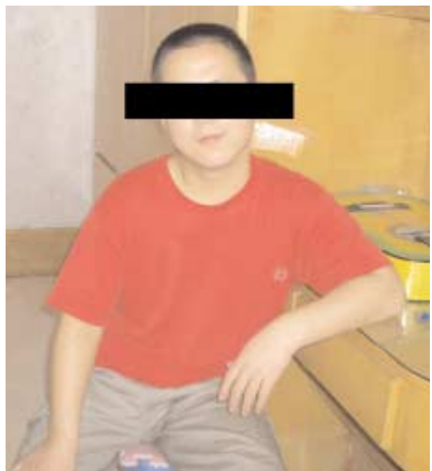
A North Korean interviewee.

[...] had all the team leaders punished by making them move heavy rocks from one place to another - about 100 metres apart - until he said stop. The team leader responsible for the sleeping prisoner was so angry that he took a stick and beat the prisoner's back and legs. The prisoner couldn't walk for three weeks. He suffered a fracture in one leg. 79