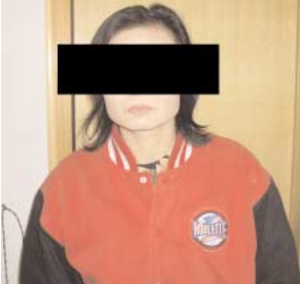
A North Korean interviewee.

Female prisoners used strips taken from their underclothes to use as sanitary napkins during their menstrual cycle. They sometimes had to use the strips again without washing them. 96