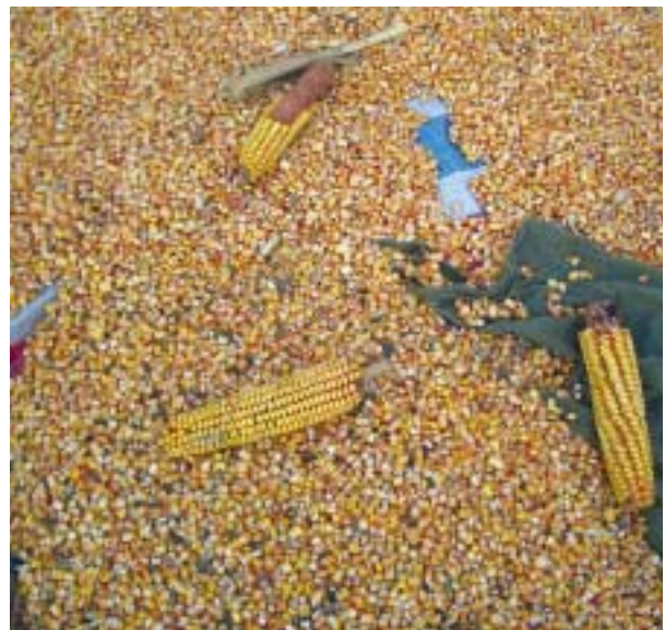
Corn kernels being dried in the sun.

Because I wasn't eating properly, my hair fell out in lumps - I still have bald patches today. Due to malnutrition, my nails were so weak that they would turn over. 100