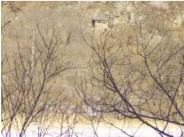
A North Korean guard post along the Tumen River.

(e.g. in contact with South Koreans or Christians or caught en route to South Korea). In general, the former were sent to a labour training camp ( nodong danryundae ) or a re-education camp ( kyohwaso ), while the latter were incarcerated in a political prison camp ( kwanliso ).