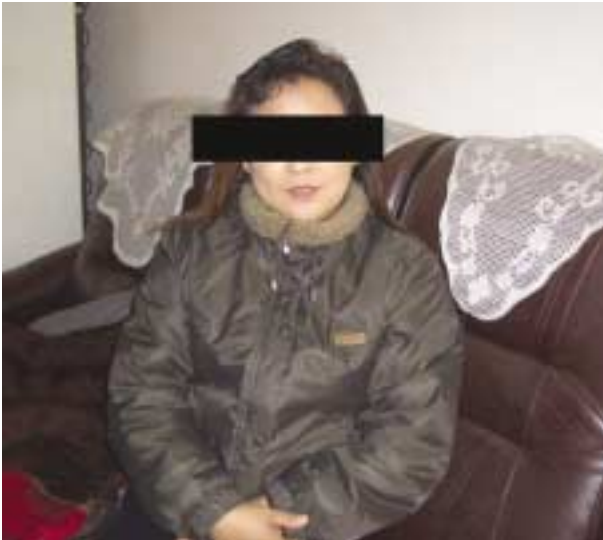
A North Korean interviewee.

asked. During a 40-minute trial in 2005, a woman from Kyongsong, aged 30, was only instructed to read out loud her confession. After she confirmed the validity of the statement, the officials sentenced her to six months in a re-education camp. She was released for time served. 119