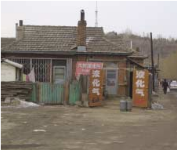
A rural neighbourhood in Jilin Province.

Rural residents, on the other hand, do not have the luxury of anonymity. Villagers know exactly where North Koreans live. One 28-year-old woman from Onsong was arrested three times by the same police because “all the villagers knew I was North Korean so when there was a crackdown, the police knew where to go”. After the third arrest, she and her husband finally decided to move out of the rural village: