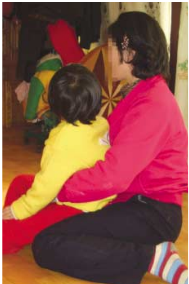
A North Korean woman married to a Chosun Jok farmer with her daughter.

In this political climate, North Koreans living in cities fear exposure from being reported by their Chinese neighbours, so they keep to themselves and avoid venturing outside their apartment. But this isolation makes them long for contact with other North Koreans. As many of the case studies indicate, this contact brings its own risks.