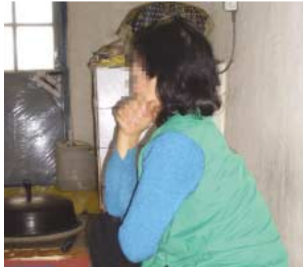
A North Korean interviewee.

Forced labour at re-education camps is more intense than at any other prison camp. Prisoners who do not work hard enough or meet a daily quota are beaten by the guards. 127 In 2001, a woman from Orang, aged 35, was given a one-year sentence at kyohwaso number 55 in Yongkwang, South Hamgyeong Province. She had originally been sentenced to six months at a labour training camp but was given a double