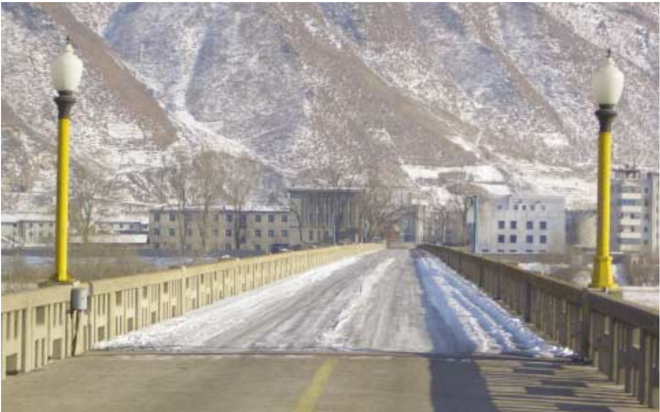
The Tumen Bridge.

Their personal details are registered again followed by a humiliating body search. Guards engage in a very thorough and invasive search because prisoners go to great lengths to hide money, either by wrapping it tightly in plastic before swallowing it or inserting it in their vagina or anus. The reason so many hide money is because they need it during their incarceration to buy food or medicine or to bribe guards (e.g. for better treatment or early release). Prisoners are told to undress, put their hands behind their head and squat and stand repeatedly with their legs spread wide while a guard watches for any money to drop from their private areas.