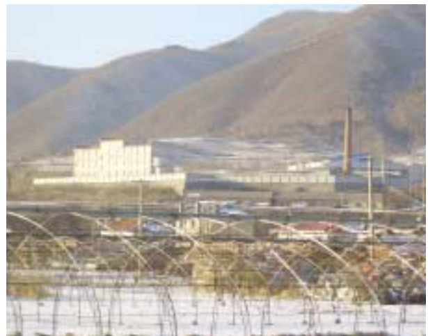
The Tumen border detention centre.

In general, the period of incarceration for undocumented North Koreans at these border facilities is brief. Their deportation, however, can be delayed because they are too sick to travel or have to wait either for more North Koreans to arrive or for the conclusion of a trial involving them and a Chinese citizen. One 32-year-old woman from Kilchu was arrested at the Yanji bus station in July 2006 as she was about to board a bus for Shenyang (en route to South Korea).