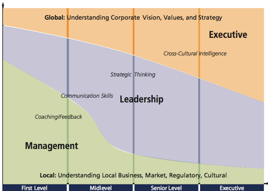
Figure 2. Progressive Leadership Curriculum for China