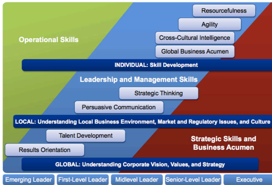
Figure 3. Development Capabilities by Leadership Level