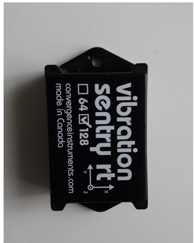
Figure 1. Accelerometer used in the study: Vibration Sentry E-16g; Convergence Instrument, Canada.

Acceleration was measured using a MEMS (micromachined microelectromechanical systems)-type 3DA (Vibration Sentry E-16g, Convergence Instrument, Canada, dimensions 7.62 \times 3.94 \times 2.06 cm) (Figure 1). The device was chosen because of its high memory capacity, which would make it suitable for long-term observations. The accelerometer was attached by one of the authors, an experienced veterinarian (NP), to the foal's tail using Leucoplast® tape to hold it in place (Figure 2). When the device was attached for the first time, the foal's behavior was monitored carefully to see if the foals or mares reacted to the device. Increased tail movements, looking at the tail direction, kicking, biting, or nervous behavior could have been a sign of discomfort for the foal. In cases of signs of discomfort, the device would have to be removed. The mares were also monitored, as they could potentially try to remove or bite the device. If the mares showed interest in the device (smelling, touching, repeatedly looking at the device or tail area), it would have to be removed to avoid possible violent