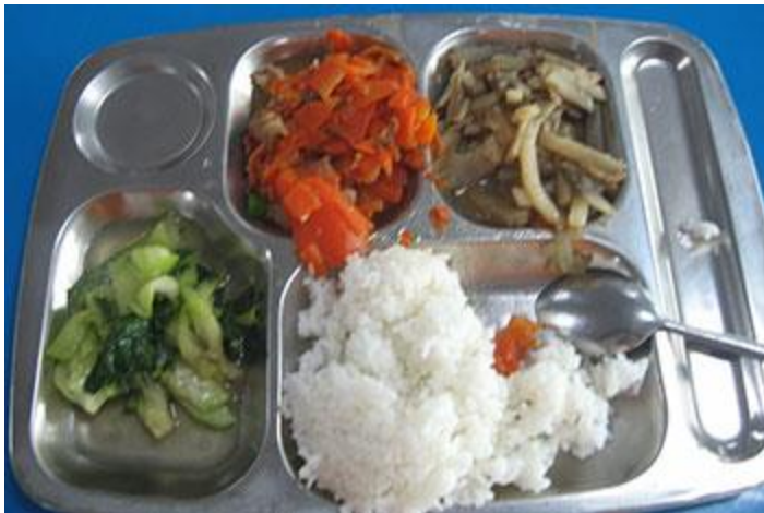
A meal at the cafeteria

If a worker loses her electrostatic ring, she is charged 10 RMB. If a worker scratches the paint off a phone, she is penalized 30 RMB on the spot. Management will penalize a worker 50 RMB if she takes too much rice and doesn't finish it. If a non-formal worker smokes in non-smoking areas, she will be penalized the entire month's subsidy, which may be as much as 200 RMB. Dispatch workers are fired for smoking in non-smoking areas. If a dorm room's lights are found to still be on after everyone is sleeping, everyone in the room is penalized 20 RMB.