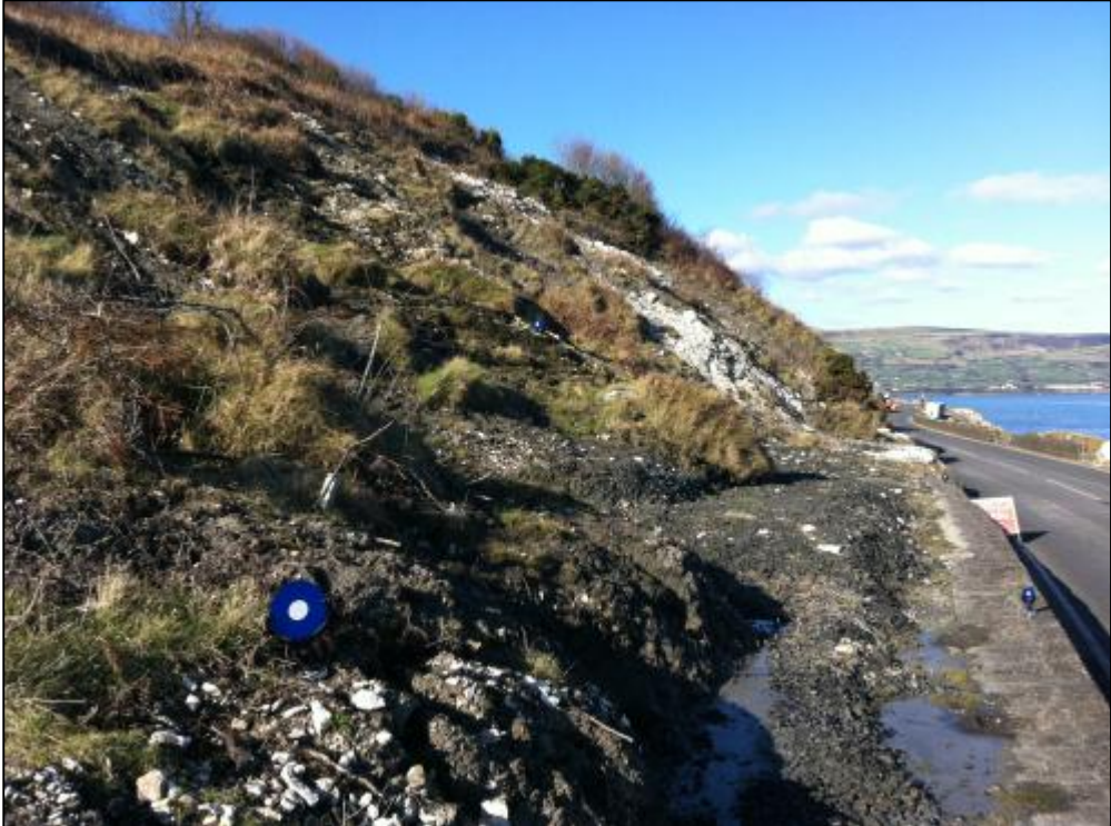
Figure 2 Debris from landslides along the Antrim Coast Road