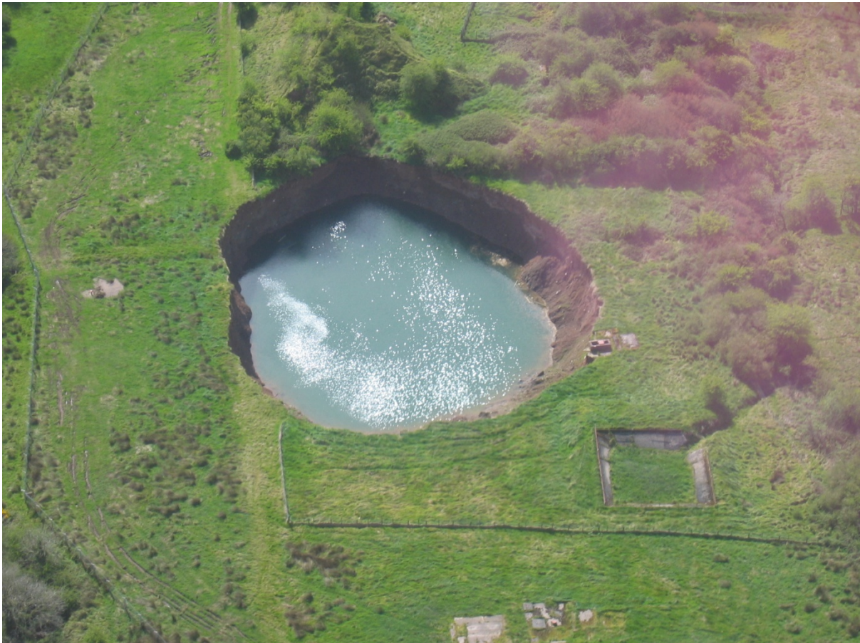
Figure 1 Large crown hole above abandoned salt mines near Carrickfergus in 2001

The project is funded by NERC under the Environmental Risks to Infrastructure Innovation Programme. For further details contact David Hughes at Queen's University Belfast d.hughes@qub.ac.uk