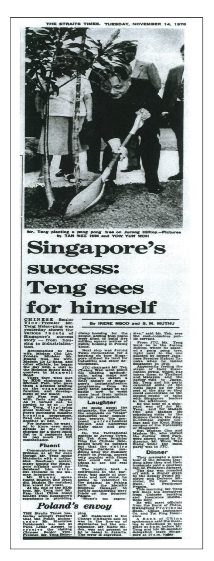
Figure 2. The portrayal of Deng's visit to Jurong Industrial Park in Singapore ( The Straits Times , 14 Nov 1978)